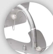
Optional Cable Routing System