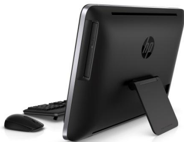
HP ProOne 400 G1 All-in-One Business PC (rear)