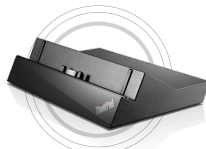
ThinkPad 10 Tablet Dock