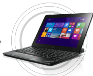
ThinkPad 10 Ultrabook Keyboard