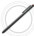
ThinkPad 10 Digitizer Pen