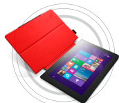
ThinkPad 10 Quickshot Cover