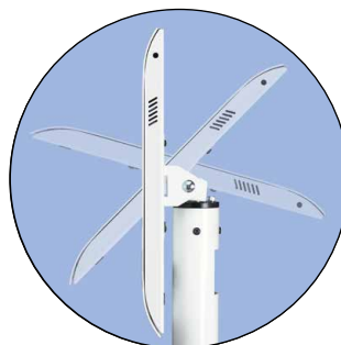
180° Rotation and 45° Tilt