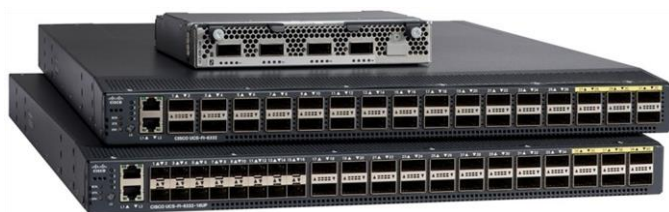
Figure 2. Cisco UCS 6300 Series Fabric Interconnects and 2304 Fabric Extender

From a networking perspective, the Cisco UCS 6300 Series uses a cut-through architecture, supporting deterministic, low-latency, line-rate 10 and 40 Gigabit Ethernet ports, switching capacity of 2.56 Terabits per second (Tbps), and 320 Gbps of bandwidth per chassis, independent of packet size and enabled services. The product family supports Cisco® low-latency, lossless 10 and 40 Gigabit Ethernet 1 unified network fabric capabilities, which increase the reliability, efficiency, and scalability of Ethernet networks. The fabric interconnect supports multiple traffic classes over a lossless Ethernet fabric from the server through the fabric interconnect. Significant TCO savings can be achieved with an FCoE optimized server design in which Network Interface Cards (NICs), Host Bus Adapters (HBAs), cables, and switches can be consolidated.