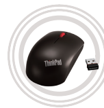
ThinkPad® Optical Wireless Mouse Mouse for All