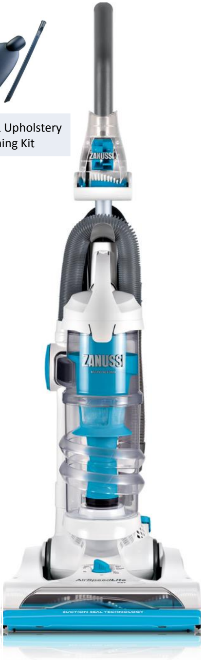
ZAN2211CI Ice White/Blue