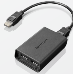
DisplayPort to Dual-DisplayPort Monitor Cable