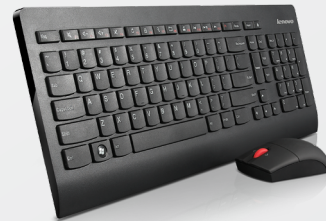
Lenovo® Ultrathin Wireless Keyboard and Mouse Combo