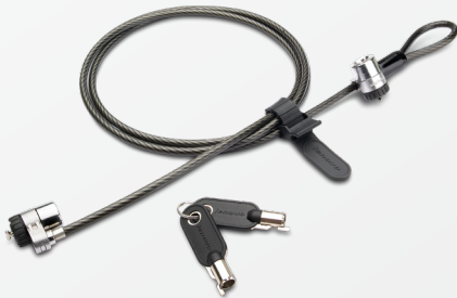
Kensington Microsaver security cable lock from Lenovo®