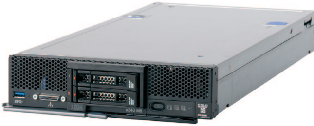
IBM Flex System x240 M5 Compute Node

performance without sacrificing energy efficiency. This family of processors features up to 45 MB L3 cache per socket, integrated PCIe 3.0, Intel Turbo Boost Technology 2.0, Hyper-Threading Technology and two QuickPath interconnects. Also new is TruDDR4 Memory support that requires only 1.2 V of power each, compared to 1.35 V and 1.5 V for previous modules. In fact, each x240 M5 will be able to support up to 1.5 TB of memory 1 in 24 DIMM slots running at up to 2133 MHz. The TruDDR4 Memory portfolio includes RDIMMs with advanced error correction for reliability, performance and maximum memory capacity. In addition, TruDDR4 Memory will support memory performance that exceeds industry standards. The x240 M5 also offers versatile high-performance storage options such as dual 2.5-inch PCIe flash storage and mirrored SD card for hypervisor.