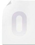
No printout permitted

Job Accounting also enables tracking of color and mono printing costs, easy monitoring of printing activity, and greater control of printer usage. It generates reports for administrative, bill-back or cost-accounting purposes. User permissions can be assigned and are stored on the printer—not on the network—so the system is totally secure.