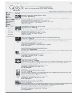
Crisp, clear Black & White