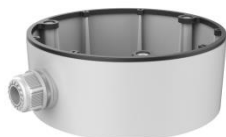
DS-1280ZJ-DM26 Junction box