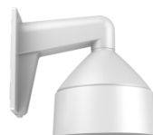
DS-1273ZJ-DM26 Wall mount