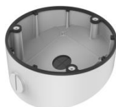
DS-1281ZJ-DM26 Inclined ceiling mount