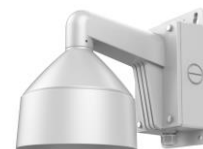
DS-1273ZJ-DM26-B Wall mount with junction box