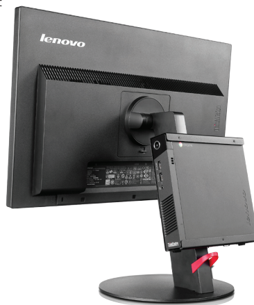
Chromebox Tiny deployed with ThinkCentre Tiny Clamp Bracket Mounting Kit

Default 4 USB, 2 front 2 rear (4 USB 3.0 ) 1 x DP, 1 x HDMI 1 x Combo Jack 1 x Ethernet