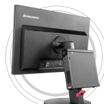
ThinkCentre® Tiny Clamp Bracket Mounting kit