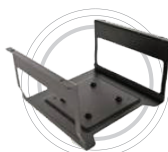
ThinkCentre® Under Desk Mount