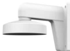
Indoor/Outdoor wall mount DS-1272ZJ-120