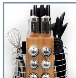
Gadgets needed for food prep.