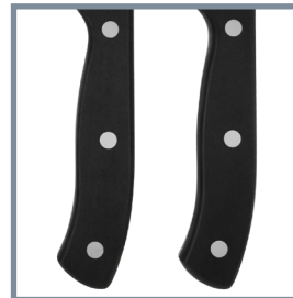
Ergonomically designed handles