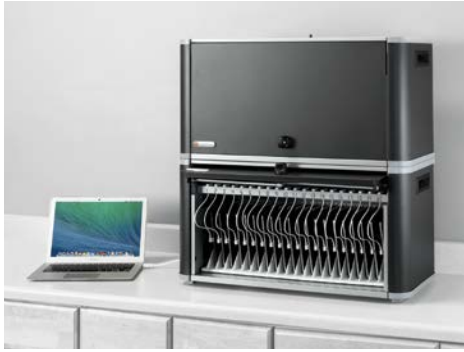
Stackable design allows for up to three units to be combined in a single footprint.