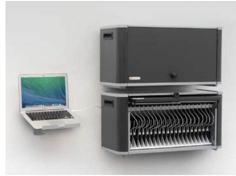
Where counter space is limited, the PowerSync+ Station™ can be wall mounted.