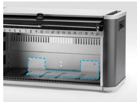
The Station 20 can be surface mounted with an included bracket providing additional security for a single unit or additional stability when stacked.