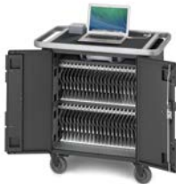
PowerSync+ Cart™ 40 for iPad and iPad mini

Learn more about our PowerSync+™ enabled products at bretford.com/apple