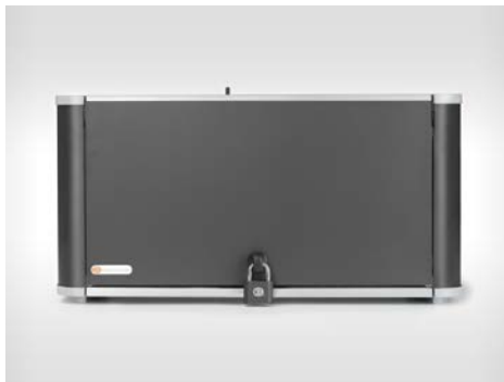
Devices are protected by all steel construction and a torque-resistant handle.