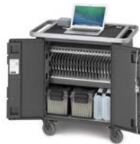
PowerSync+ Cart™ 20 for iPad and iPad mini