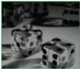
2000:1 Contrast Ratio

Add more depth to your image with a high contrast projector; with brighter whites and ultra-rich blacks, images come alive and text appears crisp and clear - ideal for business and education applications.