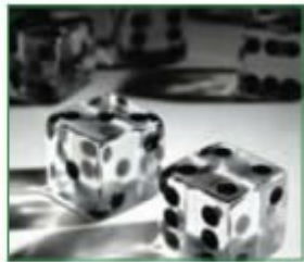
20,000:1 Contrast Ratio