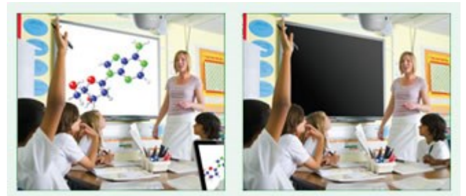
Eco AV mute off 100% power consumption

Stay in control of your presentation with Eco AV mute. Direct your audience's attention away from the screen by blanking the image when no longer needed. This also reduces the power consumption by up to 70%, further prolonging the life of your lamp.