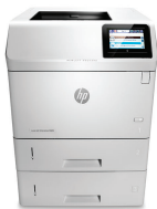
HP LaserJet Enterprise M605x