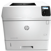
HP LaserJet Enterprise M605dn