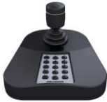
DS-1005KI USB Joy-stick