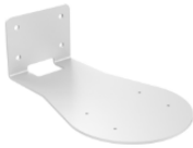
DS-1692ZJ Wall Mount Bracket