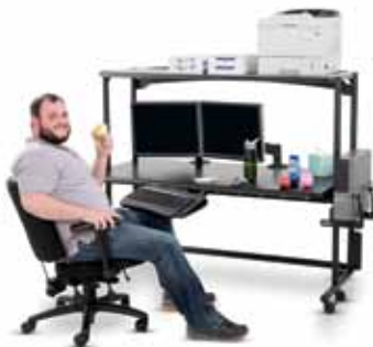
Top: Carlos's 60" w AnthroCart in Fog helps maximize his workspace. Bottom: Marcus's 60" w AnthroCart in Black keeps everything within arms reach, shown with optional CPU SideRack, Keyboard and Mouse Caddy, Monitor Arms, Extension Tubes and Small Additional Shelf.