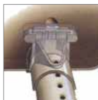
Patented shelf supports

Shelves are made with 1" thick industrial grade high density particle board so they're incredibly strong. The combination of sturdy shelves, 16 gauge steel tube legs and our patented shelf support mechanism means AnthroCarts can hold up to 150 pounds of your equipment!