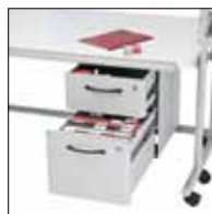
6" h and 11" h File Drawer