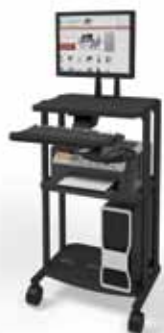
Top: UltraCompact Cart in Fog with optional CPU SideRack. Bottom: UltraCompact Cart in Black with optional Monitor Mount, Extension Tubes, Metal Base Shelf, and 4" casters.