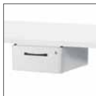
Large 6" h Drawer