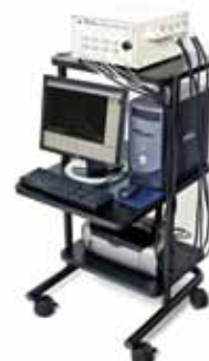
Top: Kyle's 36" w AnthroCart in Black sports an optional CPU SideRack, Extension Tubes, Keyboard Drawer and Small Additional Shelf. Bottom: The perfect building blocks, AnthroCarts are easy to configure for your equipment, shown with optional Small Additional Shelf.