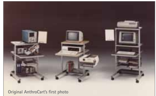
Original AnthroCart's first photo

In 1984, personal computers were beginning to influence the workplace. Mobile carts were just the ticket for folks looking for a place to put these amazing new machines. We're proud of those Original AnthroCarts – and equally proud of the our new AnthroCart 2 family. With refreshed color combinations, sizes and new integrated cable management, AnthroCart 2 is a celebration of the staying power of this cart over the past 30 years.