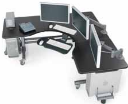
ELEVATE ORIGINAL CORNER