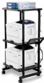
Top: Keep your small equipment on the move with a compact mobile Equipment Cart. Shown in Fog with optional Additional Small Shelf. Bottom: The strong Equipment Cart holds up to 150 lbs. Shown in Black with optional Extension Tubes, Additional Shelf, and Clamp-on Handle.