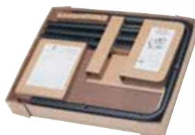
Everything you need for assembly is in the box!

Vinyl T-molding along the edge of the shelf surfaces prevents dings on edges. The baked-on powder coat finish on the legs is the toughest finish available! All these details add up to make an AnthroCart able to withstand the daily wear and tear that comes with any work environment.