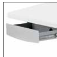
Zido® 4.5" h Drawer