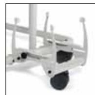
CPU SideRack with Caster