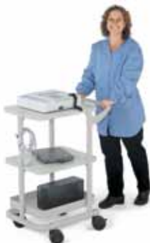
Top: As the tiniest AnthroCart, MiniCart certainly earns its name – though it's just as strong and rugged as other AnthroCarts. Bottom: Add the optional Handle, Equipment Hold-down, Metal Bin and 4" Casters for a nimble cart that can maneuver through tight spaces.