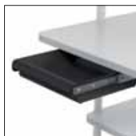
Small 3" h Drawer