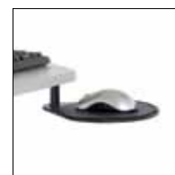
Swing-out Mouse Shelf