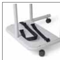
Metal Base Shelf