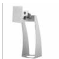
Flat Panel Monitor Mount