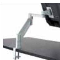
Flat Panel Monitor Arms (Standard and Super models to support your monitor's weight)