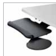
Keyboard and Mouse Caddy