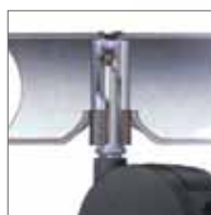
Caster inserts that won't bend or break.

The simple design of the AnthroCart means you won't have to spend a lot of time putting your AnthroCart together. Detailed assembly instructions along with all the necessary tools are included with every cart.