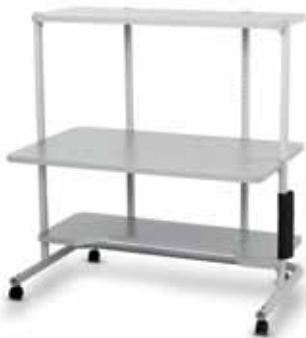
Top: Jessica's 48" w AnthroCart in Black is roomy enough for all of her equipment. Shown with optional Small 3" h Drawer and FileAround. Bottom: Add storage to any AnthroCart with optional Extension Tubes and Additional Shelves.