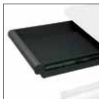
Large 3" h Drawer