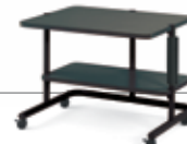
36" w AnthroCart