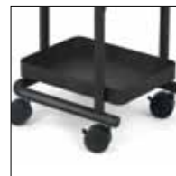
MiniCart Metal Bin