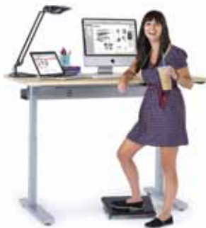
ELEVATE II SINGLE SURFACE