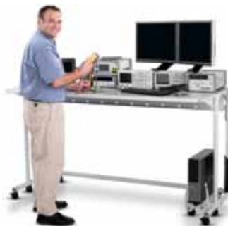
Top: The 72" w AnthroCart in Fog makes efficient use of larger spaces. Bottom: After selecting a 72" w AnthroCart in Fog to hold all of his test equipment, Brady added Extension Tubes so he can work standing. Shown with optional CPU SideRack, Monitor Arms, and Extension Tubes.