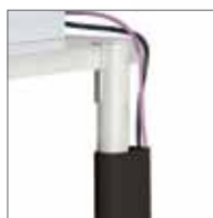
Cable management tools are included

Shelves adjust at 1" increments along the vertical tubes so you can place your work surface or additional storage at whatever height best fits your needs. Best of all, the adjustability means the cart grows with you. Choose from our widest array of accessories to configure the cart to fit your equipment and room space, now and in the future.