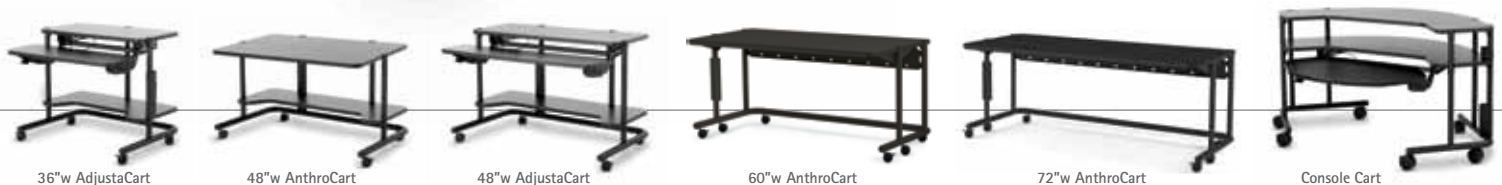
36" w AdjustaCart