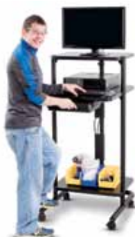
Top: The 24" w AnthroCart in Fog makes a compact desk for laptops. Bottom: Beau's 24" Cart in Black is durable enough for manufacturing environments. Shown with optional Extension Tubes, Small Additional Shelf and Small 3" Drawer.