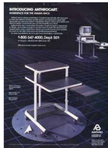
AnthroCart's first advertisement, in the inaugural issue of Macworld Magazine.