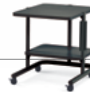
24" w AnthroCart