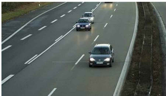
Without Smart Codec*

Smart Codec can effectively reduce the video packet size while maintaining good video quality. It allocates more bandwidth to moving object or areas of interest, resulting in lower bandwidth and storage requirements.