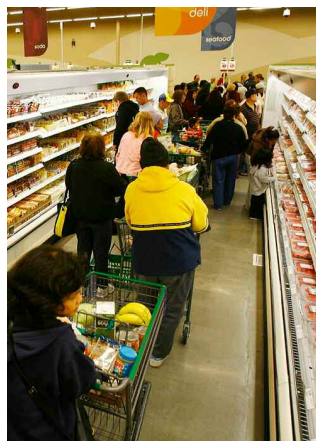
Hallway View* (90° rotation)