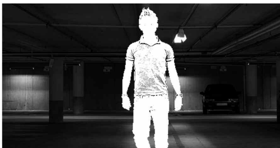
Adaptive IR Off*