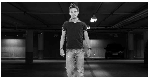
Adaptive IR On*

Adaptive IR automatically adjusts the IR LED intensity in order to avoid over exposure of close objects.