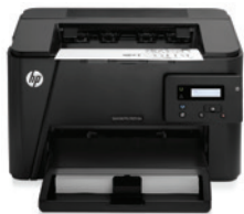
(HP LaserJet Pro M201dw)