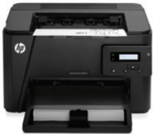
(HP LaserJet Pro M201n)

Enhance security with plenty of built-in and optional security features, increase productivity with reliable, automatic duplex printing and fast print speeds, and print from smartphones, tablets, or laptops with mobile printing options. 7