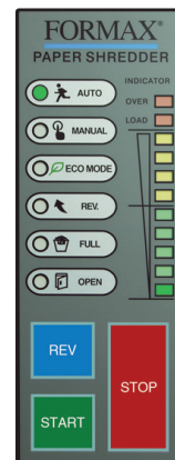
Easy-to-use control panel with Load Indicator and ECO Mode

Safety Circuit Breaker: Ensures safe operation