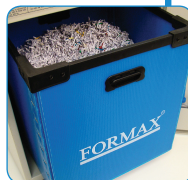
Lifetime Guaranteed Heavy-Duty Waste Bin