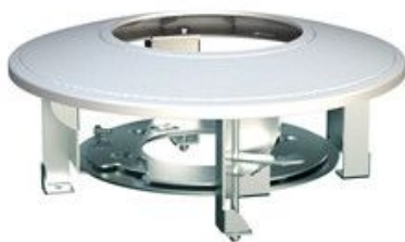
Indoor in-ceiling mount DS-1227ZJ