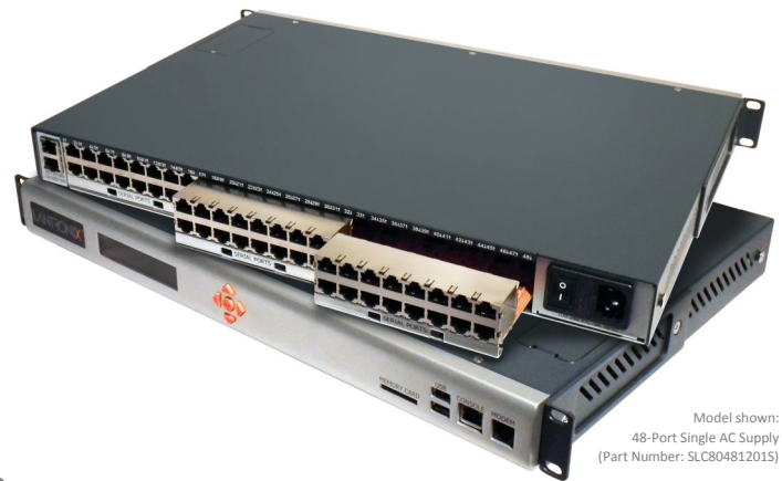
Model shown: 48-Port Single AC Supply (Part Number: SLC804812015)

The Lantronix ® SLC ™ 8000 advanced console manager is the industry's first modular console server that provides secure remote access to IT equipment, while reducing deployment costs and time.