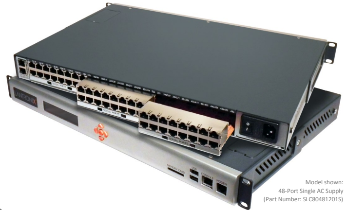
Model shown: 48-Port Single AC Supply (Part Number: SLC804812015)

The Lantronix ® SLC ™ 8000 advanced console manager is the industry's first modular console server that provides secure remote access to IT equipment, while reducing deployment costs and time.