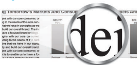
De-ICE (Integrated Cavity Effect)