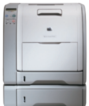
HP Color LaserJet 3700/n/dn/dtn Printer HP Color LaserJet 3700dtn shown