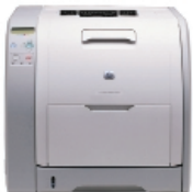
HP Color LaserJet 3550/n Printer series