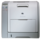
HP Color LaserJet 3500/n Printer series

Bring colour into your business and give it a head start with these affordable, fast and professional HP Color LaserJet Printers.