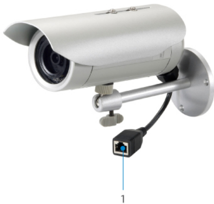
1. Ethernet Port