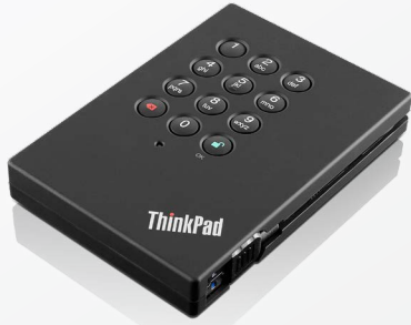
ThinkPad® USB Secure Hard Drive