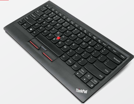
ThinkPad® Wireless Bluetooth® Keyboard with TrackPoint®