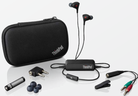
The ThinkPad® Noise Cancelling Earbuds