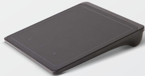
Lenovo® Wireless TouchPad for Windows 8