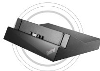
ThinkPad 10 Tablet Dock