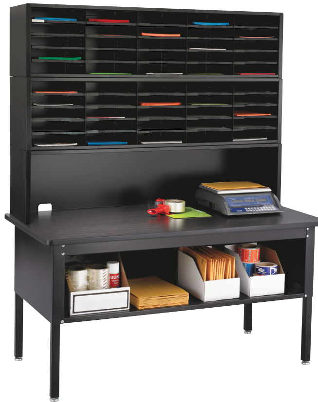
Table Top Colors