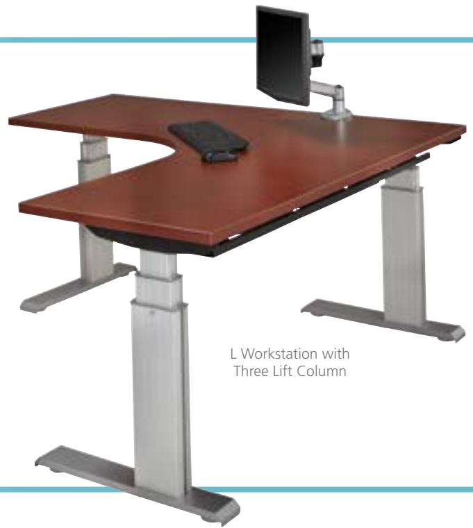
L Workstation with Three Lift Column