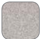
Gray Matrix (GM)