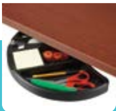
Swivel Pencil Tray 300PTB