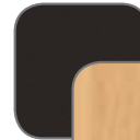
Black Base Hardrock Maple Top (BHM)