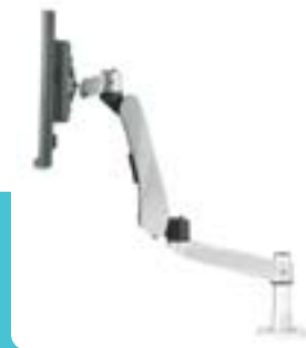
Hover Series 2 Monitor Arm HS3111