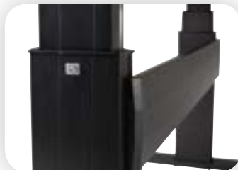
Optional height adjustable cross support available

See Spec Book for complete specifications: raproducts.com/price