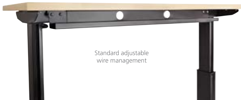
Standard adjustable wire management