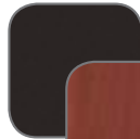
Black Base Cherry Top (BC)

(Only Available on Standard 24" Configurations)