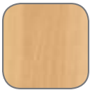
Hardrock Maple (HM)