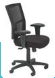
CT3000 Task Chair