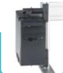
310CPU Adjustable CPU Holder