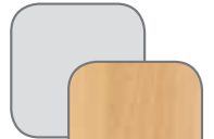
Silver Base Hardrock Maple Top (SHM)