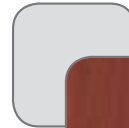
Silver Base Cherry Top (SC)