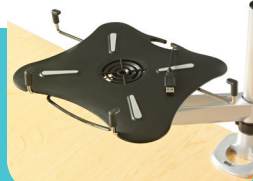
Laptop Fan LF400