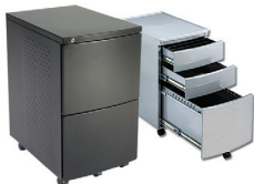
Mobile Pedestal 500MP & 502MP