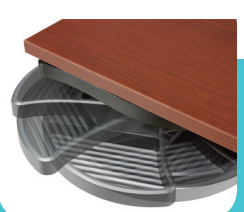
Swivel Pencil Drawer 300PTB