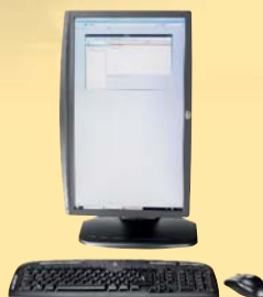
Display rotating by 90°