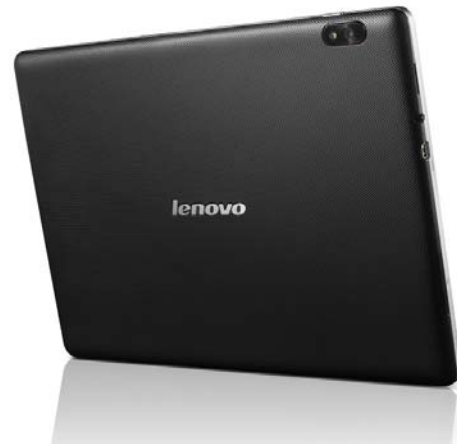
IdeaTab S2110 (Back)