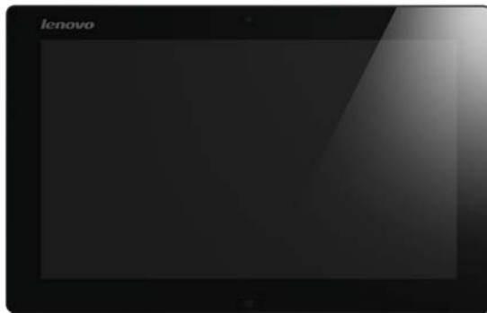
IdeaTab Lynx K3011 (Front)