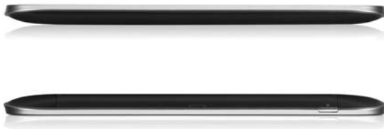
IdeaTab A2109 (Top and Bottom)