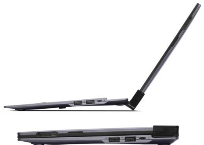
IdeaTab Lynx K3011 with optional keyboard dock (coming soon)