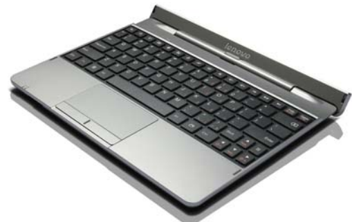
Optional keyboard dock