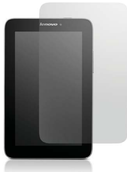
IdeaTab A2107 Screenguard (coming soon)