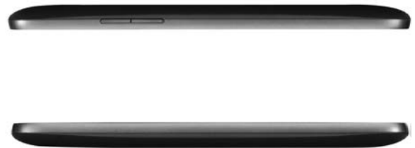
IdeaTab A2107 (Left and Right)