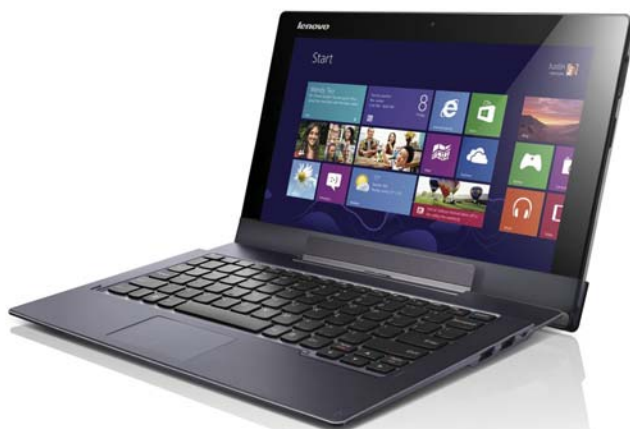
IdeaTab Lynx K3011 with optional keyboard dock (coming soon)