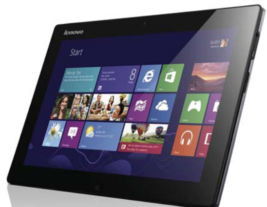
IdeaTab Lynx K3011