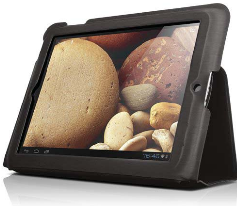
IdeaTab S2109 Folio Case (coming soon)