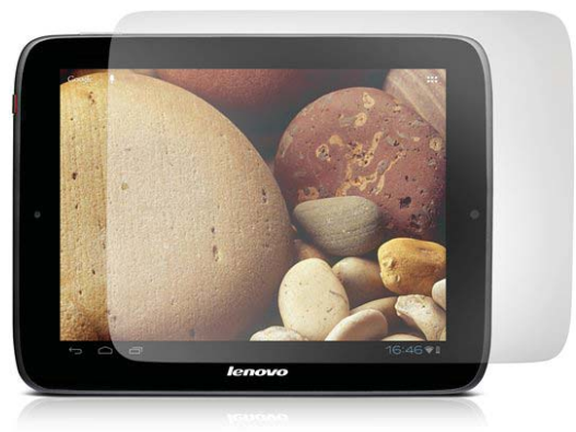
IdeaTab S2109 Screen Protector (coming soon)