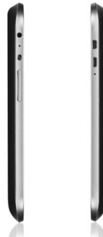
IdeaTab A2109 (Left and Right)