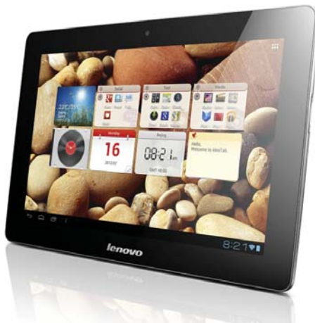
IdeaTab S2110 (Front)