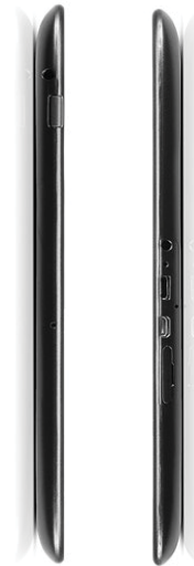
IdeaTab S2109 (Left and Right)