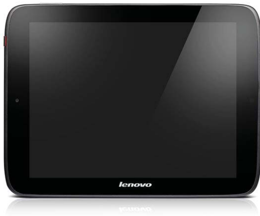
IdeaTab S2109 (Front)