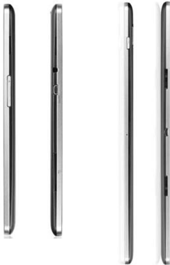
(Left and Right) (Top and Bottom)