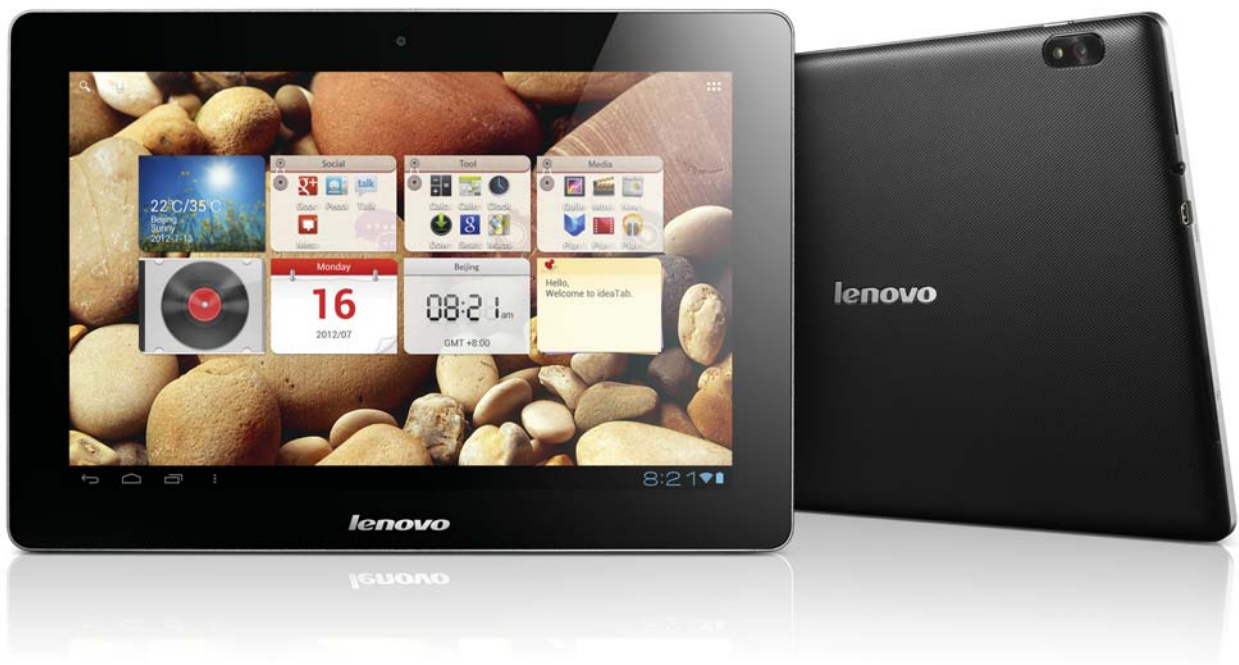
Lenovo IdeaTab S2110

Visit www.lenovo.com/psref for the latest version