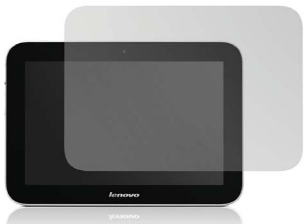
IdeaTab A2109 Screen Protector (coming soon)