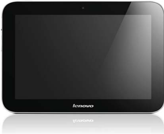
IdeaTab A2109 (Front)