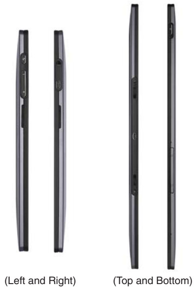
(Left and Right) (Top and Bottom)