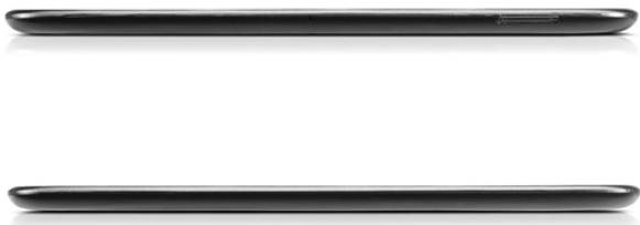
IdeaTab S2109 (Top and Bottom)