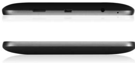
IdeaTab A2107 (Top and Bottom)