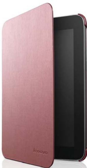
IdeaTab A2107 Case (coming soon)