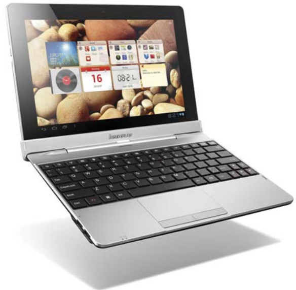
IdeaTab S2110 with optional keyboard dock