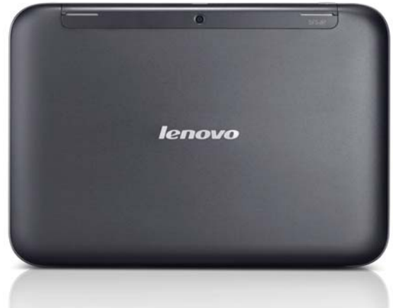
IdeaTab A2109 (Back)