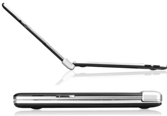
IdeaTab S2110 with optional keyboard dock