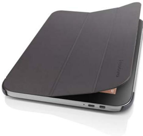
IdeaTab A2109 Folio Cover (coming soon)