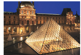
Dynamic Contrast Ratio