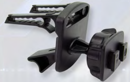
GN047-SBH Removable Air Vent Mount