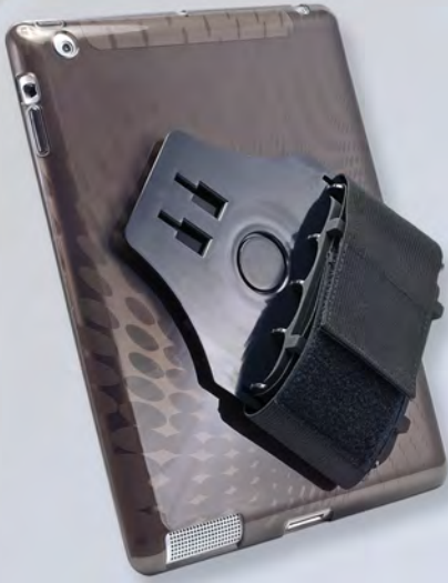
MHIP200 MyHandstand™ Swivel Hand Holder for Apple iPad 2