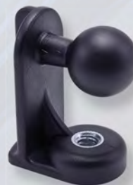
AP142017MM 1/4"-20 Camera Bolt Pattern to 17mm Ball Adapter

* Use with Mobile Grip Universal Holder (Sold separately)