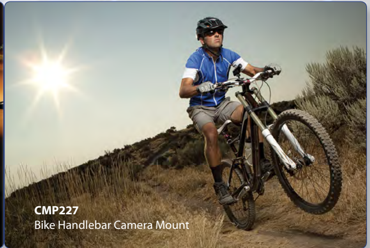
CMP227 Bike Handlebar Camera Mount

Industry Standard 1/4"-20 Threaded Mounting Screw