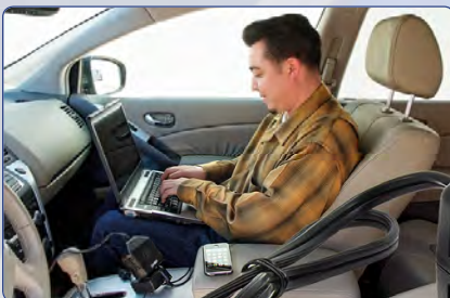
CADAU-150B Deluxe Power Inverter - 3-in-1 with USB, DC, and AC Port (150W)