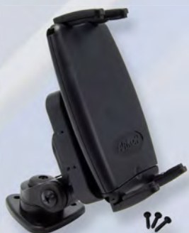
SM528 / IPM528 1" Multi-Angle Adhesive or Screw Mount for Dashboard or Console