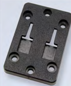
AP016 Vertical Female Dual T-Slot to 4-Hole AMPS Adapter