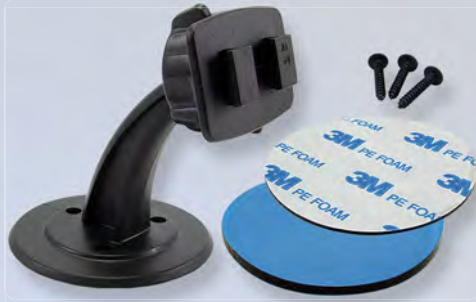
GN016-SBH 2.5" Travelmount® Adhesive Dashboard, Removable Desktop, or Screw Mount