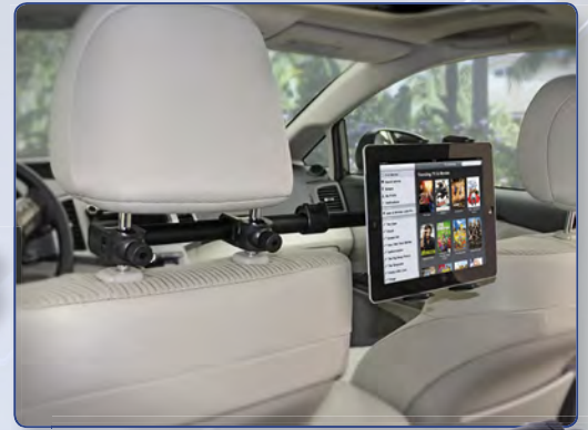
HM002-SBH Headrest Mounting Pedestal