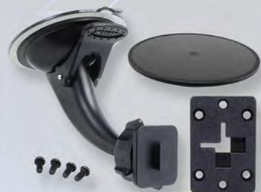
SR115 Mini Windshield or Dashboard Mount