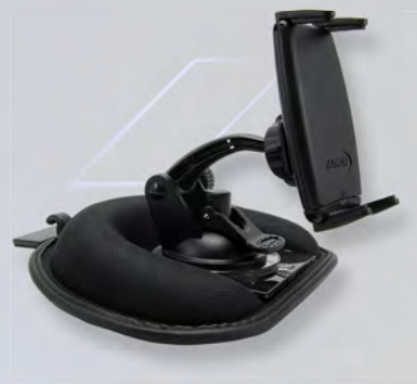
SM512 / IPM512 Mini Friction Dashboard Mount with Travelmount® Deluxe Windshield Pedestal