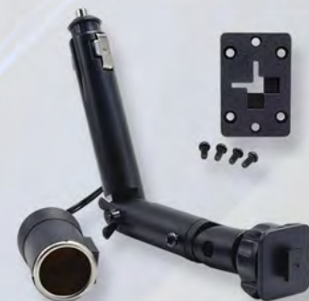
SR197 Lighter Socket Mount with Power Dongle