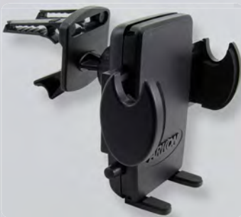
SM429-SBH Removable Air Vent Mount with Swivel Ball Head