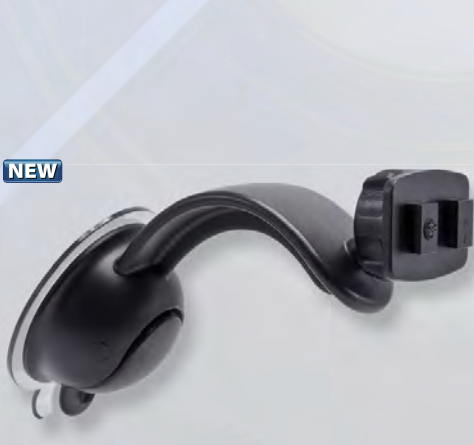
NEW GN018-SBH (OEM only) Travelmount® Professional 5" Windshield Suction Pedestal