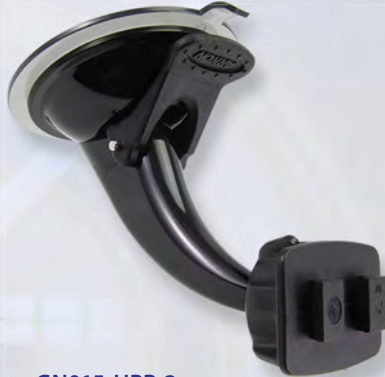
GN015-HPB-2 Travelmount® Mini Windshield Suction Pedestal with High Polished Finish