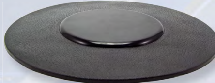
SDP001 Circular Polyurethane Sticky Dashboard Pad