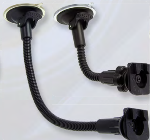
CM041-LS-2 14" Gooseneck Windshield Suction Mount CM089-ST-2 8.5" Gooseneck Windshield Suction Mount