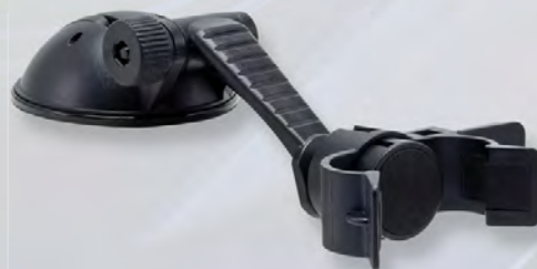
MG178 Dashboard or Flat Surface Removable Suction Desktop Mount