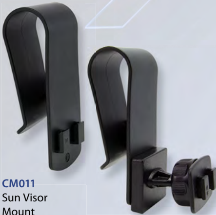
CM011 Sun Visor Mount