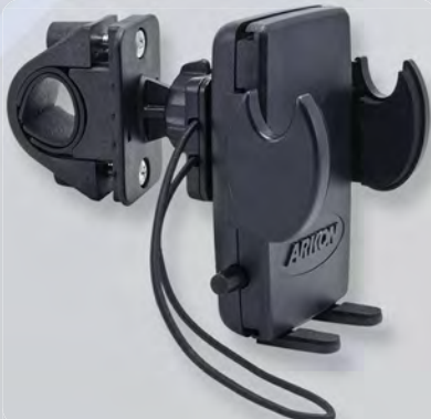
SM432 Mega Grip Smartphone Handlebar Mount with Safety Secure Strap