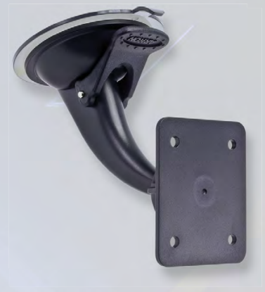
GN015-SBH-AMPS Travelmount® Mini Windshield Suction Pedestal with AMPS Mounting Head