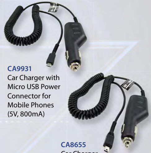
CA9931 Car Charger with Micro USB Power Connector for Mobile Phones (5V, 800mA)