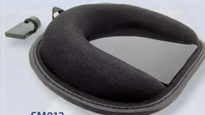
SM012 Mini Friction Dashboard Mount with Safety Anchor