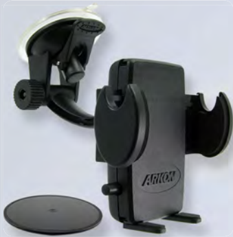
SM415 Travelmount® Deluxe Mini Windshield, Dashboard, or Console Mount