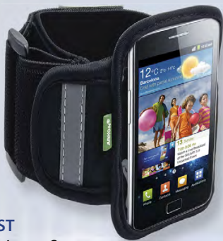
NEW XXL-WRIST Sweat-Resistant Sports Wristband for Extra Large Smartphones from 4.3" to 4.5"

Also available: SM-WRIST (not shown) Sweat-Resistant Sports Wristband for iPhone