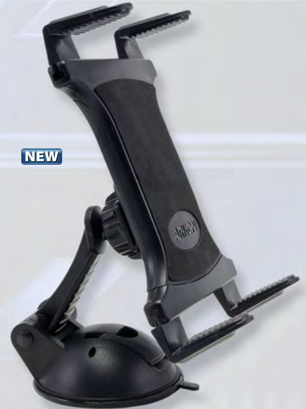
SM578 Slim-Grip® Flat Surface Mount for Smartphones