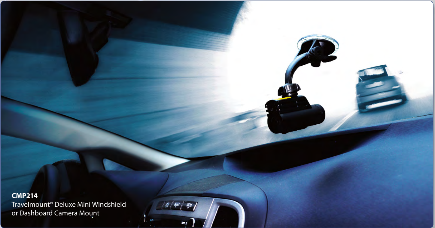
CMP214 Travelmount® Deluxe Mini Windshield or Dashboard Camera Mount