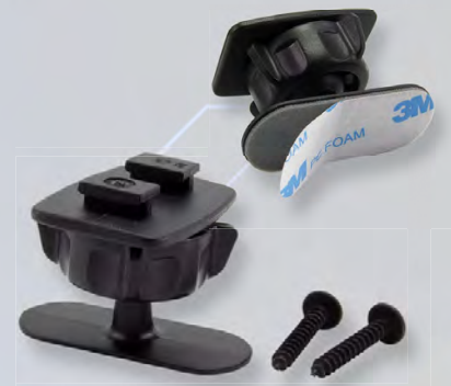
GN010-SBH 1.5" Mini Adhesive Dashboard or Console Mount - Optional Screw Mount