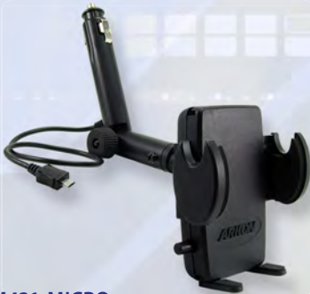
SM421-MICRO Lighter Socket Mount with Integrated Micro USB Charge Cable (5V, 800mA)