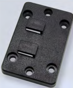
AP032SM Horizontal Male Dual T-Tab to 4-Hole AMPS