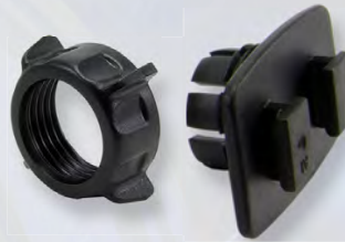
SP-SBH-KIT 17mm Ball Pattern to Dual T-Tab Adapter with Tightening Ring