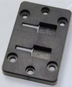
AP015 Horizontal Female Dual T-Slot to 4-Hole AMPS Adapter