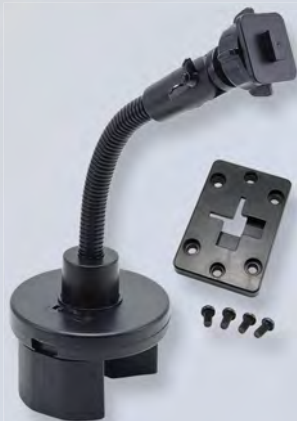
SR123 Cup Holder Mount with 6.5" Flexible Gooseneck Shaft