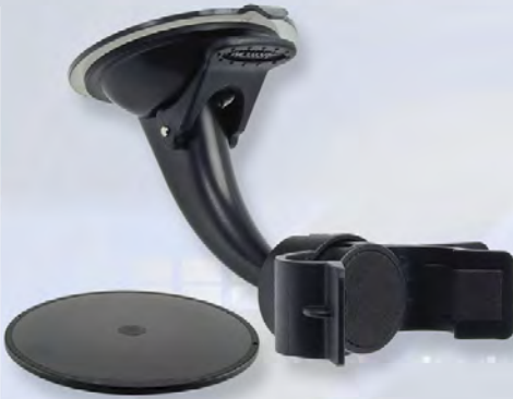
MG115 Travelmount® Mini Windshield, Dash, or Console Mount