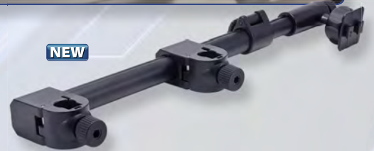
HM003-SBH Deluxe Headrest Mounting Pedestal for Centered Back Seat Viewing