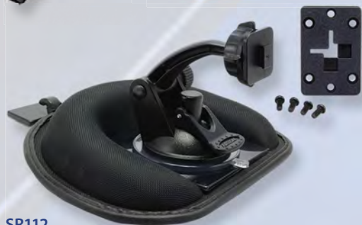
SR112 Friction Dashboard Mount with Windshield Mount Option