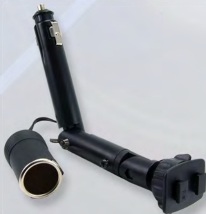
GN097-SBH Lighter Socket Mount with Integrated Power Dangle