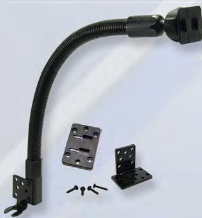
GN088-SBH 18" Flexible Aluminum Gooseneck Seat Rail or Floor Mount