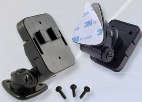
CM048-2 1" Multi-Angle Adhesive Dashboard or Console Mount - Optional Screw Mount