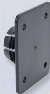
SP-SB-AMPS-22 22mm Ball to 4-Hole AMPS Pattern