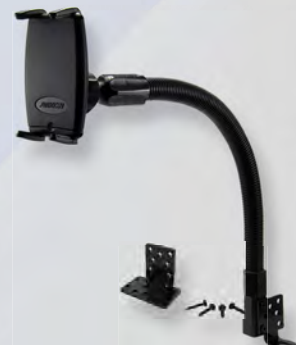
SM588 / IPM588 18" Flexible Aluminum Gooseneck Seat Rail or Floor Mount