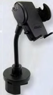
SM423-G Cup Holder Mount with Flexible Gooseneck Shaft