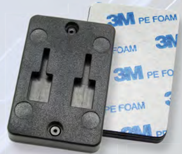
AP016-3M Vertical Female Dual T-Slot Adapter with 3M Adhesive Back