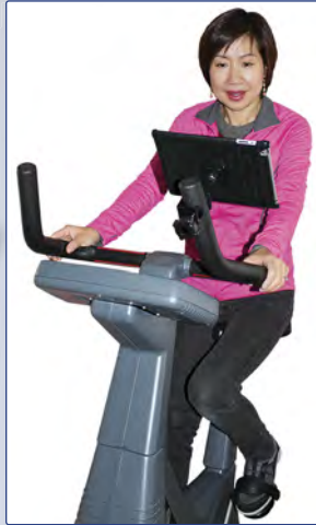
TAB085 4" Heavy-Duty Desk or Cart Mount with C-Clamp Base