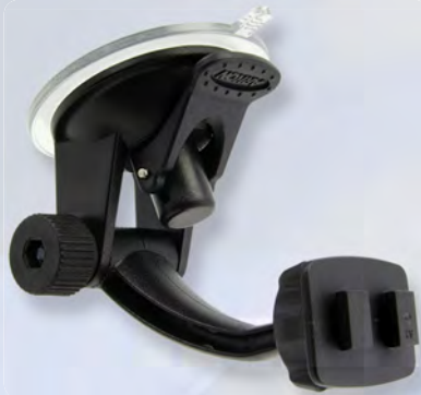
GN014-SBH Travelmount® Deluxe Mini Windshield Suction Pedestal