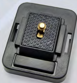
AP-CMP Standard 1/4"-20 Camera Bolt Pattern Adapter. Only compa- tible with Arkon AMPS Pattern