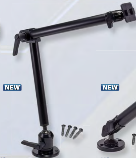
HD003 22" Heavy-Duty Aluminum 4-Hole Drill Base Mount