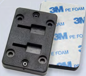
AP015-3M Horizontal Female Dual T-Slot Adapter with 3M Adhesive Back