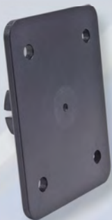
SP-SB-AMPS 17mm Ball to 4-Hole AMPS Pattern