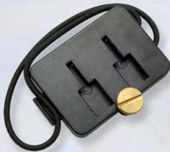
AP2TSTRAP Dual T-Slot to Dual T-Tab Handlebar Mount Adapter Plate with Elastic Securing Strap