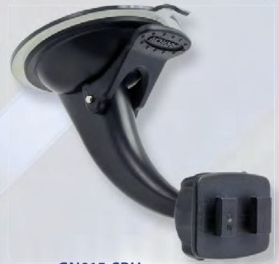
GN015-SBH Travelmount® Mini Windshield Suction Pedestal