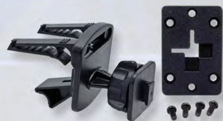
SR129 Removable Air Vent Mount