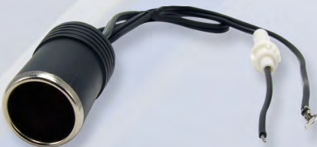
CA-JLTDHK Economical Power Adapter with Fused, Linked Harness for Motorcycles, ATVs, etc.