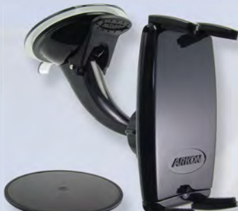
SM515 / IPM515 Travelmount® Mini Windshield or Dashboard Mount