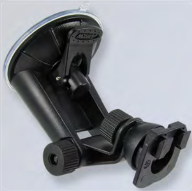
CM017-KST-2SH 5" Robust Base Windshield Suction Pedestal