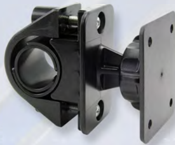
GN032-SBH-AMPS Bicycle Handlebar Mount with AMPS Mounting Head