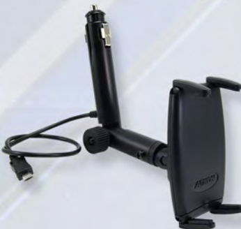
SM521-MICRO Lighter Socket Mount with Integrated Micro USB Charge Cable (5V, 800mA)