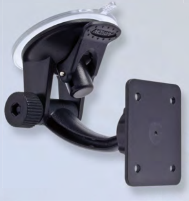
GN014-SBH-AMPS Travelmount® Deluxe Mini Windshield Suction Pedestal with AMPS Mounting Head

The 4-hole AMPS pattern is an industry standard configuration designed for semi-permanent connection rather than quick release. It consists of four holes located in a rectangular pattern spaced at 1.188" by 1.813". Many universal and device-specific holders offered by third-party mounting manufacturers are compatible with the 4-hole AMPS pattern. It is also the standard on Sirius® brand portable satellite radios.