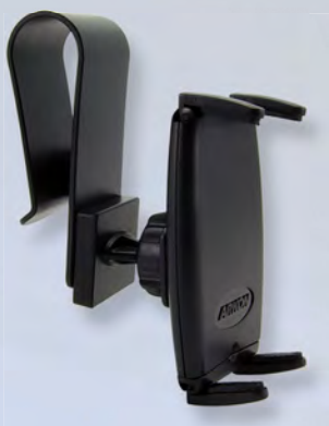
SM511 / IPM511 Auto Sun Visor Mount