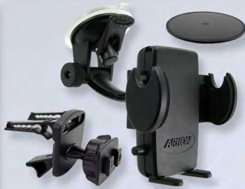
SM410 Travelmount® Mini Windshield, Dashboard, and Removable Air Vent Mount