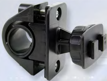
GN032-SBH Bicycle or Motorcycle Handlebar Mount