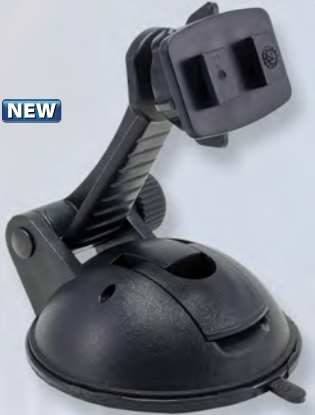
CM078-SBH (OEM only) Flat Surface Desktop Mount