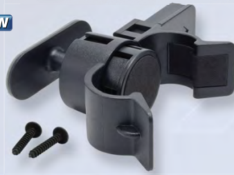
MG110 1.5" Mini Adhesive Computer Monitor, Dashboard, Desktop, or Console Mount