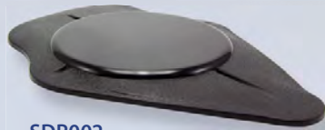
SDP002 Arrow-Shaped Polyurethane Sticky Dashboard Pad