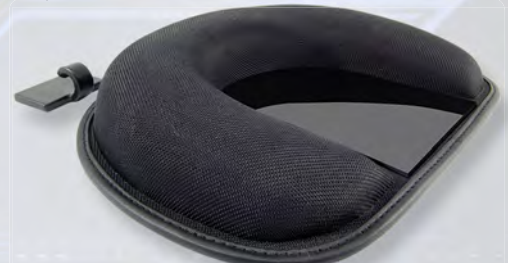
CM012 Friction Dashboard Mount with Safety Anchor