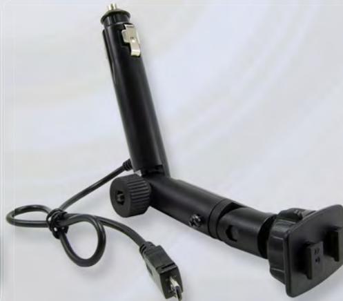
GN097-2-MICRO Powered Micro USB Lighter Socket Mount (5V, 800mA)