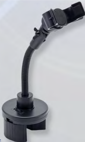
MG123-G Cup Holder Mount with Flexible Gooseneck Shaft