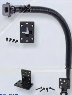
SR188-G17 15" Flexible Steel Seat Rail or Floor Mount