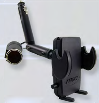
SM421 Lighter Socket Mount with Integrated Power Dongle (12V)