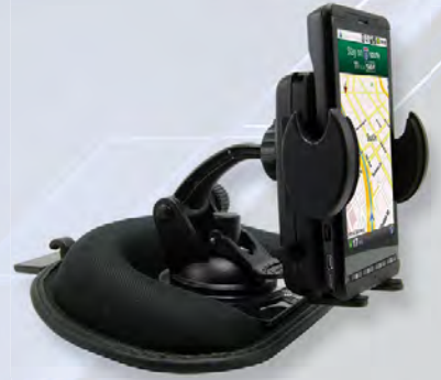
SM412 Mini Friction Dashboard Mount with Adhesive Safety Anchor