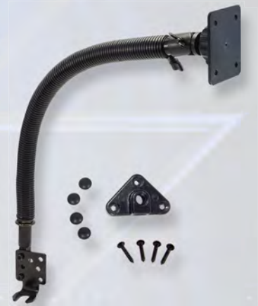
GN088-SBH-AMPS 18" Flexible Aluminum Gooseneck Seat Rail or Floor Mount with AMPS Mounting Head