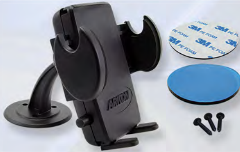
SM416 Triple Option Mini Adhesive Dashboard, Removable Desktop, or Screw Mount