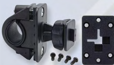
SR127 Bicycle or Motorcycle Handlebar Mount