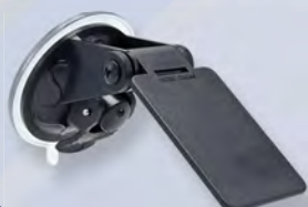
BT010 Windshield Suction External Antenna or Radar Detector Mount