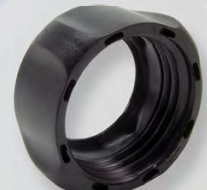
SP-SB-RING-22 Swivel Tightening Ring for 22mm Ball Heads