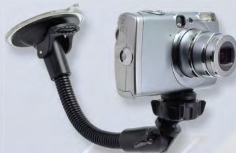
CMP220 8.5" Flexible Gooseneck Windshield Mount