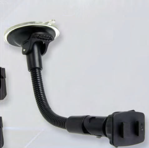
GN042-SBH 8.5" Gooseneck Windshield Suction Mount