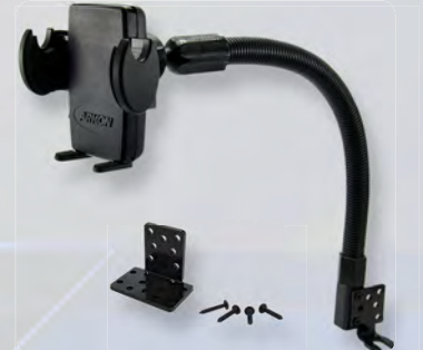
SM488 18" Flexible Aluminum Gooseneck Seat Rail or Floor Mount