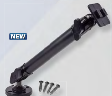
HD005 10" Heavy-Duty Aluminum 4-Hole Drill Base Mount