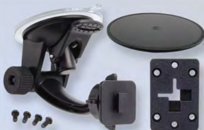
SR114 Deluxe Mini Windshield or Dashboard Mount