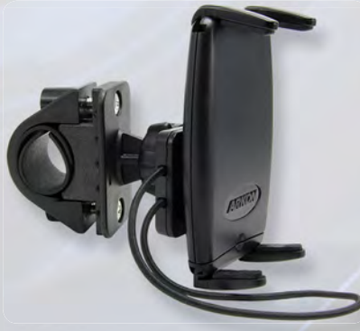
SM532 Slim-Grip® Smartphone Handlebar Mount with Safety Secure Strap