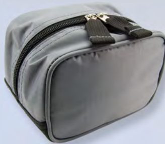
GPS-9045K Mini Travel Accessory Holder (Gray Nylon) 5.5" x 3.75" x 3.75"