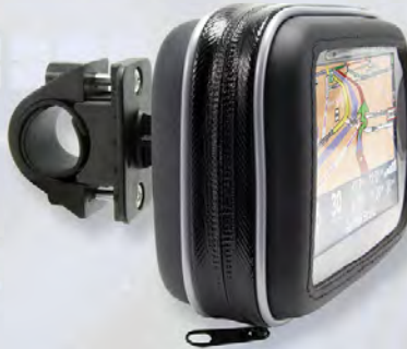
GPS032 Handlebar Mount with Water-Resistant Portable GPS Holder