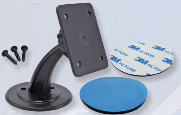
GN016-SBH-AMPS Travelmount® Adhesive Dashboard, Removable Desktop, or Screw Mount with AMPS Mounting Head