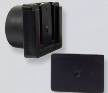
SP-SLIMTAB Slim-Tab™ Ultra-Thin Adhesive Holder and Mounting Head

* Use with Mobile Grip Universal Holder (Sold separately)