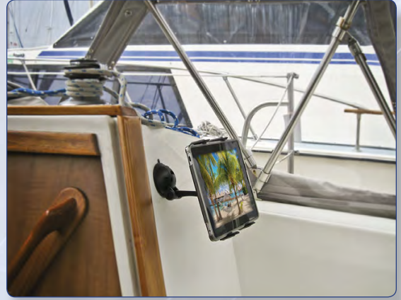
CM078-SBH (OEM only) Flat Surface Suction Mounting Pedestal