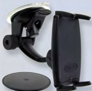
SM514 / IPM514 Travelmount® Deluxe Mini Windshield or Dashboard Mount