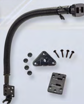
CM088-G17-SBH 15" Flexible Steel Gooseneck Seat Rail or Floor Mount