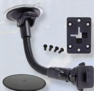
SR142 8.5" Windshield or Dashboard Mount