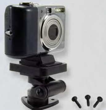
CMP128 1" Multi-Angle Adhesive or Screw Mount for Dashboard or Console