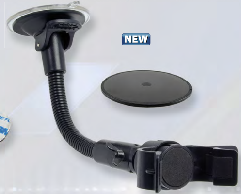
MG120 8.5" Windshield or Dashboard Mount