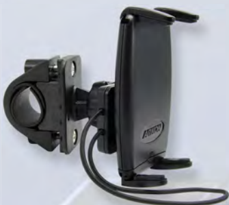
SM532 / IPM532 Bicycle and Motorcycle Handlebar Mount with Elastic Secure Strap