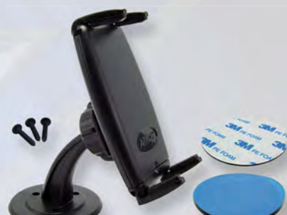
SM516 / IPM516 Triple Option Mini Adhesive Dashboard, Removable Desktop, or Screw Mount