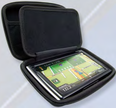
GPSHDCS7 Hard Case for Amazon® Kindle Fire™, Garmin StreetPilot 7200, Magellan RoadMate 1700, Magellan RoadMate 5310, and other 5" and 7" PNDs