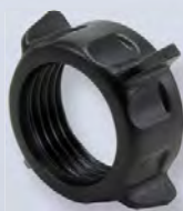
SP-SB-RING Swivel Tightening Ring for 17mm Ball Heads