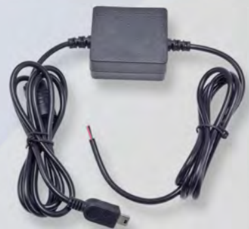
GPS-NHWC2 Mini USB Hardwire Cable for Connecting PNDs to Motorcycles, ATVs, etc. (5V, 1.5 Amps)