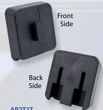
AP2T1T Slide-on Dual T-Tab to Single T-Tab Adapter