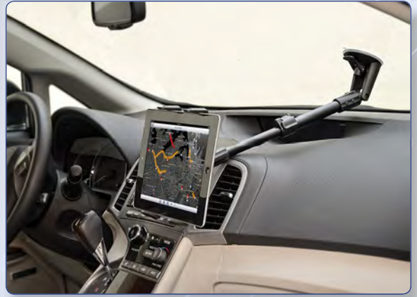
CM117-SBH 14.5" to 18.5" Telescoping Rigid Extension Windshield Suction Pedestal