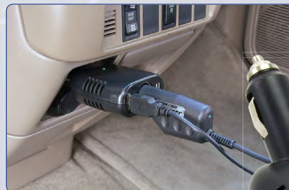
CADDCC-100 Power Inverter Charge Adapter - 12V / 24V Accessory Outlet with DC Socket and 2 USB Ports