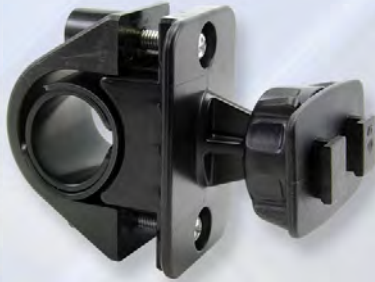
GN032-SBH Handlebar Mounting Pedestal

Fits bicycle and motorcycle handlebars up to 33mm diameter. Compatible with most straight, drop, trekking, touring, and standard (25.4mm and 26mm) size handlebars. Also for use on boat helmets, golf carts, ATVs, snowmobiles, hang gliders, or other apparatus with cylindrical frames or posts.