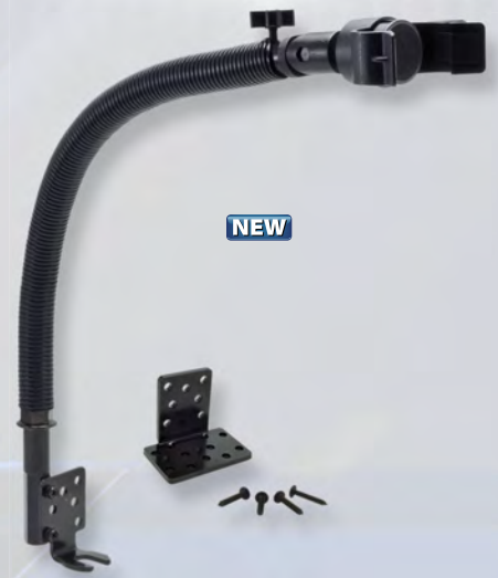
MG188 15" Flexible Steel Gooseneck Seat Rail or Floor Mount