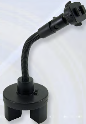
GN033-SBH Flexible Gooseneck Cup Holder Mount