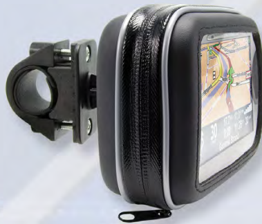
GPS032 Handlebar Mount with Water-Resistant Portable GPS Holder