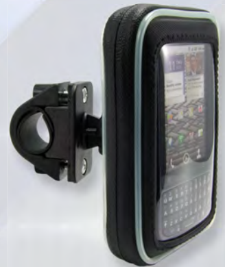
SM032 Handlebar Mount with Water-Resistant Smartphone Holder