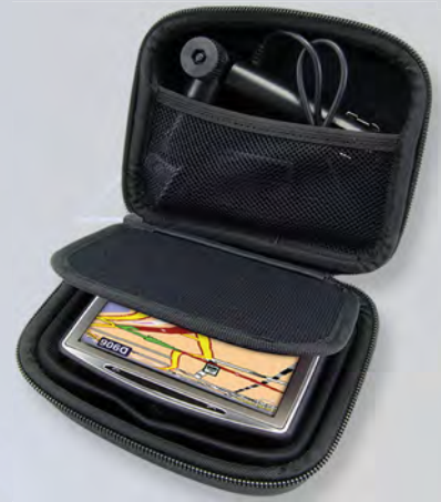
GPSHDCSXL Extra Large, Hard-Shell Protective GPS Case for 4.3" Devices with Mesh Pocket (Black) Inner Dimensions: 5.5" x 4" x 2.25"