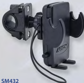
SM432 Bicycle and Motorcycle Handlebar Mount with Elastic Secure Strap