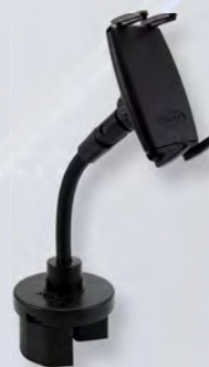
SM523-G / IPM523-G Cup Holder Mount with Flexible Gooseneck Shaft