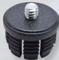
SP-1420CAM 17mm Ball to 1/4"-20 Camera Bolt Pattern