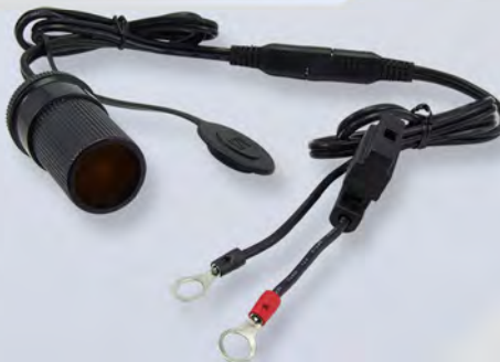
CA-DHWK Deluxe Power Adapter with Fused, Linked Harness for Motorcycles, ATVs, etc.