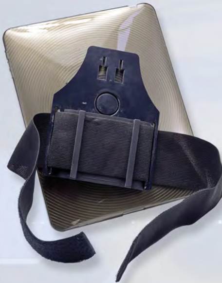
NEW MHKM200 MyHandstand™ Knee Mount for Pilots Fits Apple iPad 2