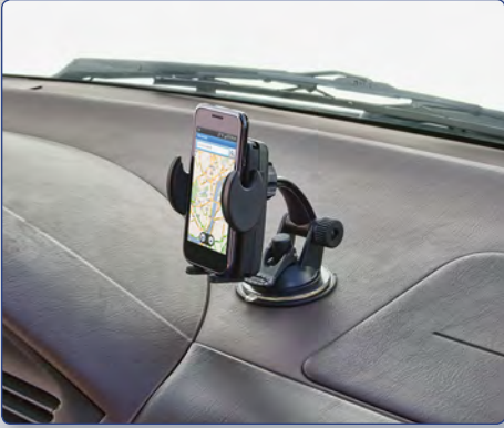
SM415 mounted on a dashboard