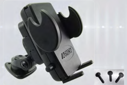
SM428 1" Multi-Angle Adhesive or Screw Mount for Dashboard or Console