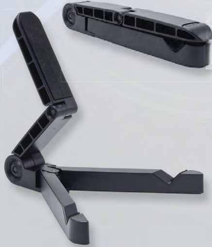
IPM-TAB1 IPM-TAB1-R (in Retail Blister) Portable Desktop or Travel Stand for Tablet Computers