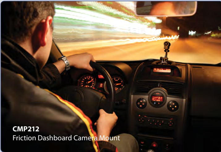
CMP212 Friction Dashboard Camera Mount