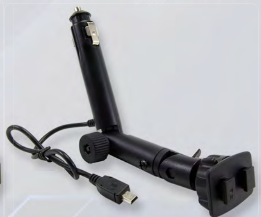
GN097-2-USB Powered Mini USB Lighter Socket Mount (5V, 800mA)