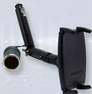
SM521 / IPM521 Lighter Socket Mount with Integrated Power Dongle