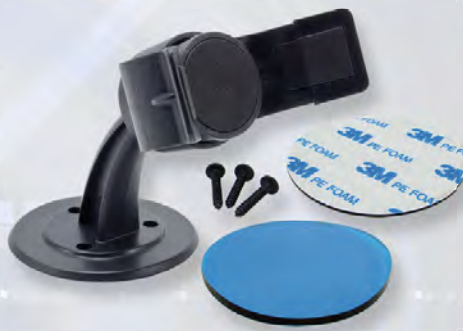
MG116 Triple Option Mini Adhesive Dashboard, Removable Desktop, or Screw Mount