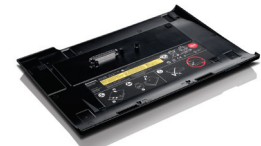
ThinkPad Battery 19+ 6-cell Slim External (0A36280)