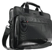
(41U5062) ThinkPad Ultraportable Case (43R2480) ThinkPad Executive Leather Case