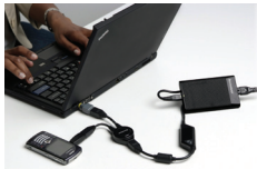
Lenovo 90W Ultraslim AC/DC Combo Adapter (41R4493)