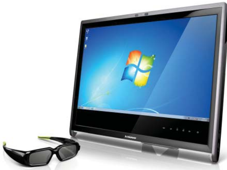
Lenovo L2363d Wide Monitor

Visit www.lenovo.com/psref for the latest version