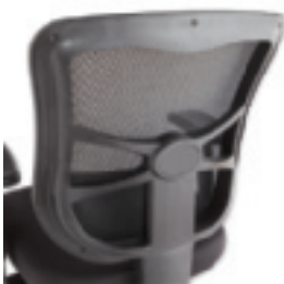
Back delivers support and cool mesh comfort.