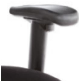
Arms adjust vertically, front-to-back and at angles.