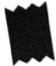
Black Fabric (seat)