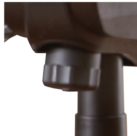
Adjusts for customized ergonomic comfort.