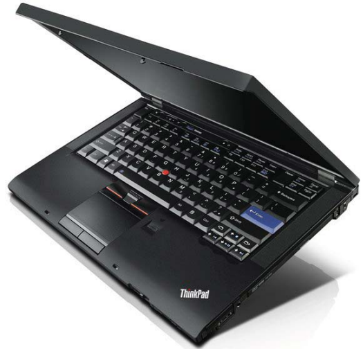
Lenovo ThinkPad T410