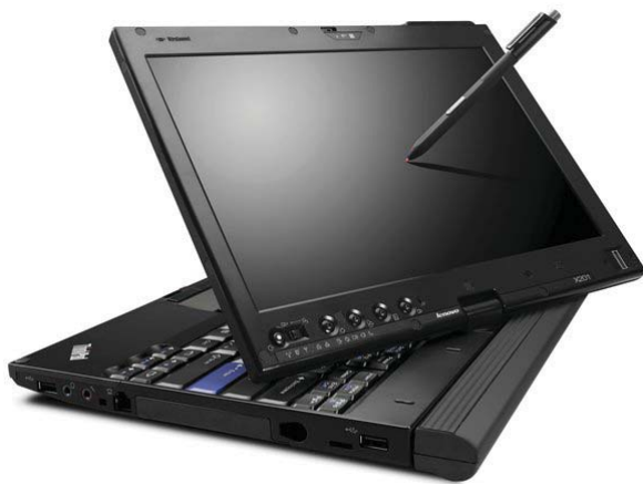
Lenovo ThinkPad X201 Tablet