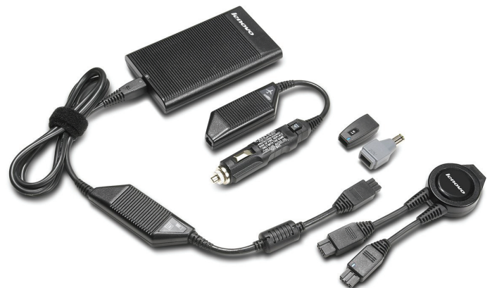
90W Ultraslim AC/DC Combo Adapter 41R4493