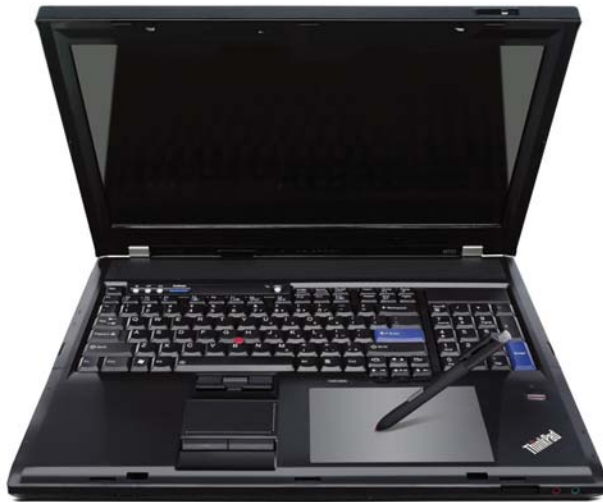
Lenovo® ThinkPad W701