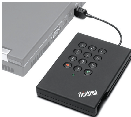
USB 2.0 Portable Secure Hard Disk 160GB 43R2018 320GB 43R2019