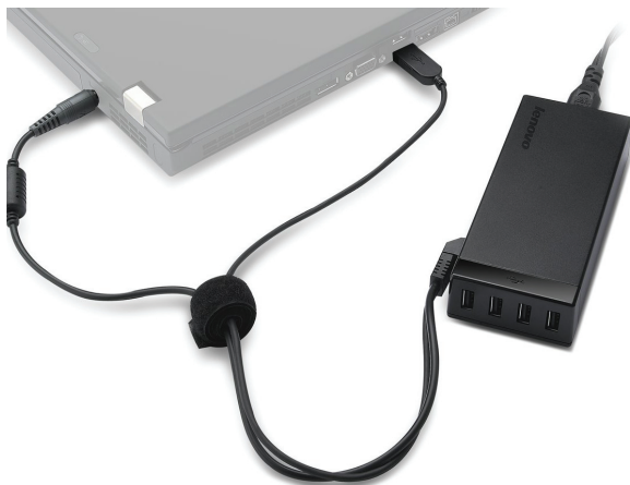
Lenovo® Power Hub 57Y4600