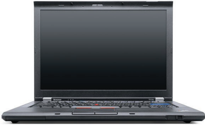
Lenovo® ThinkPad T410s