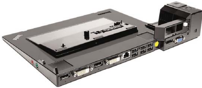
ThinkPad Mini Dock Plus Series 3 433810U