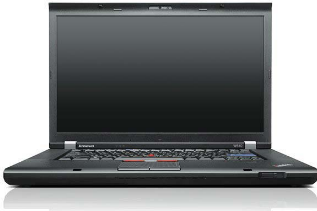
Lenovo® ThinkPad W510