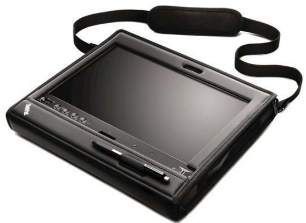
Lenovo ThinkPad X201 Tablet with ThinkPad X200 Tablet Sleeve 43R9115