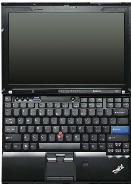
Lenovo ThinkPad X201 (UltraNav model)