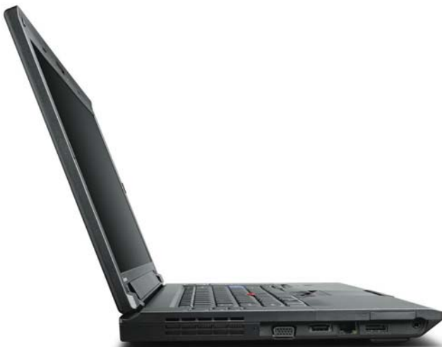
Lenovo ThinkPad L512