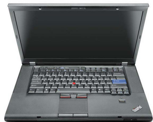
Lenovo ThinkPad W510