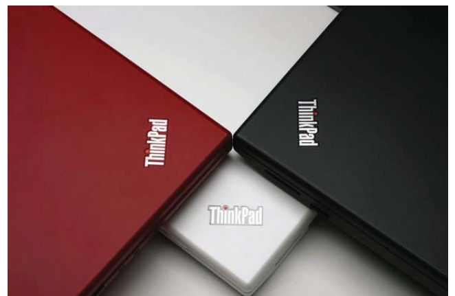
Lenovo ThinkPad X100e family