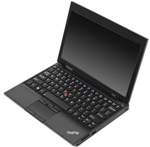
Lenovo ThinkPad X100e