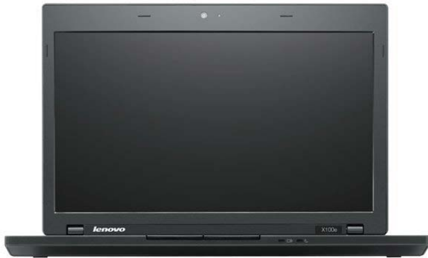
Lenovo® ThinkPad X100e