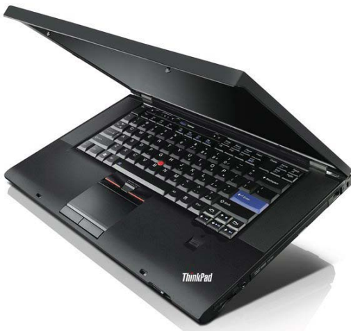
Lenovo ThinkPad T510