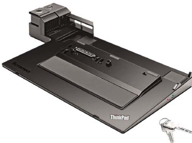
ThinkPad Mini Dock Plus Series 3 - Mobile WorkStation 433820U