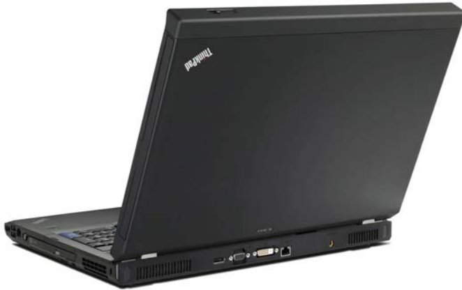
Lenovo® ThinkPad W701ds