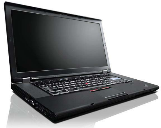
Lenovo ThinkPad W510