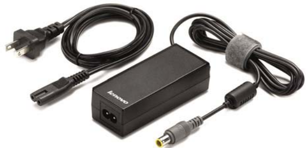
ThinkPad 65W AC Adapter 40Y7696