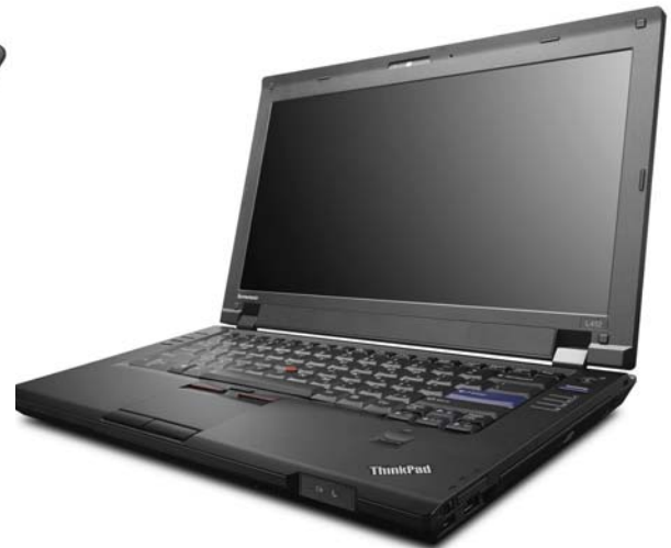
Lenovo ThinkPad L512