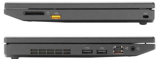
Lenovo ThinkPad X100e with 3-cell battery