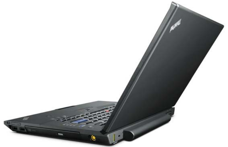
Lenovo ThinkPad L512 with ThinkPad Battery 55++ (9-cell) 57Y4186