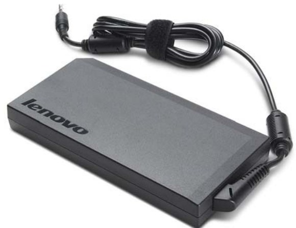
ThinkPad 230W AC Adapter 55Y9333