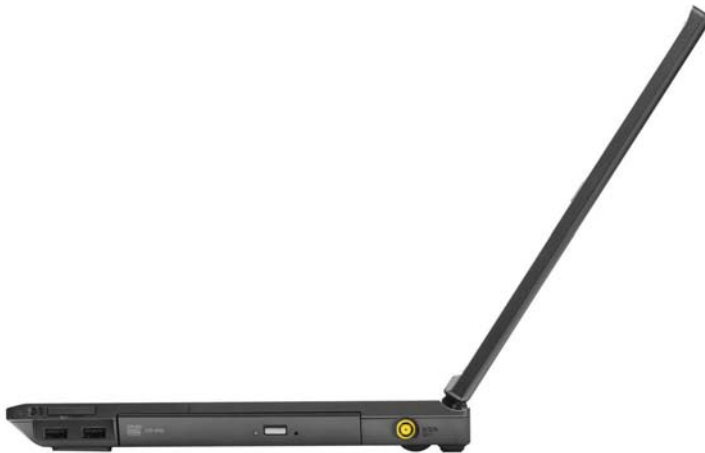
Lenovo ThinkPad L512