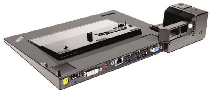
ThinkPad Mini Dock Series 3 433710U