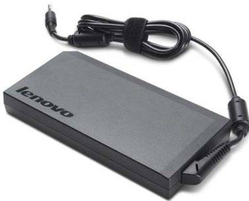
ThinkPad 170W AC Adapter 41R4421