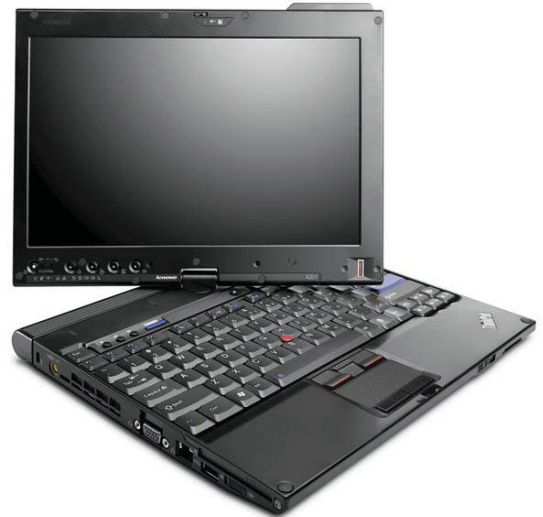
Lenovo ThinkPad X201 Tablet