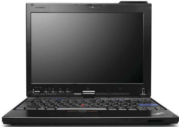
Lenovo® ThinkPad X201 Tablet