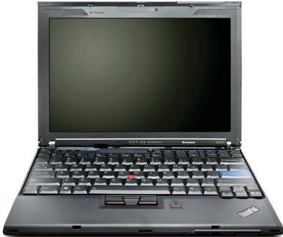
Lenovo® ThinkPad X201 (TrackPoint model)