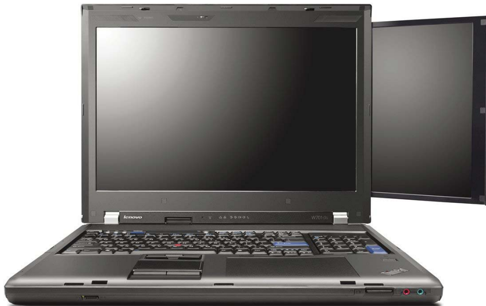
Lenovo ThinkPad W701ds