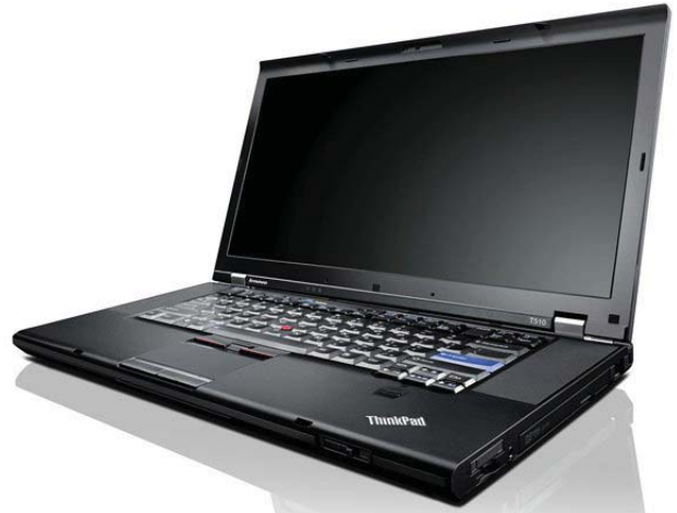
Lenovo ThinkPad T510