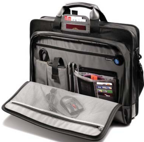
ThinkPad 17W Business Topload Case 43R9117