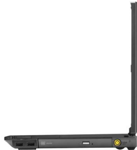
Lenovo ThinkPad L412