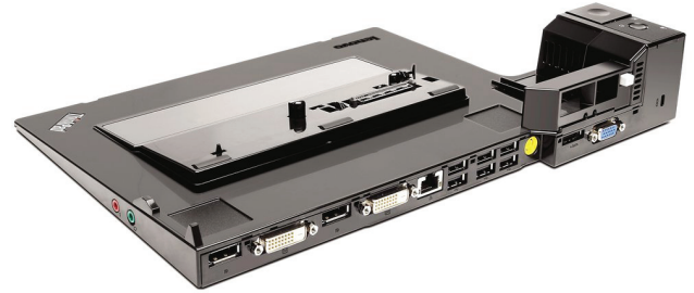
ThinkPad Mini Dock Plus Series 3 433810U