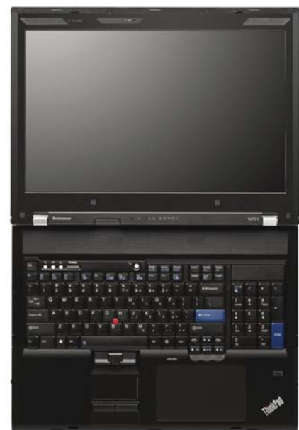
Lenovo ThinkPad W701