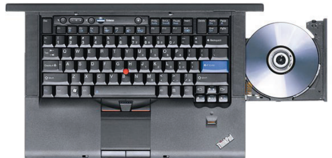
Lenovo ThinkPad T410s