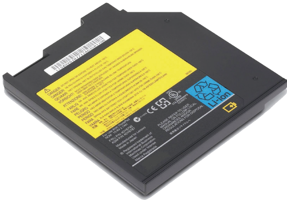
ThinkPad Battery 42 (3-cell, bay) 57Y4536