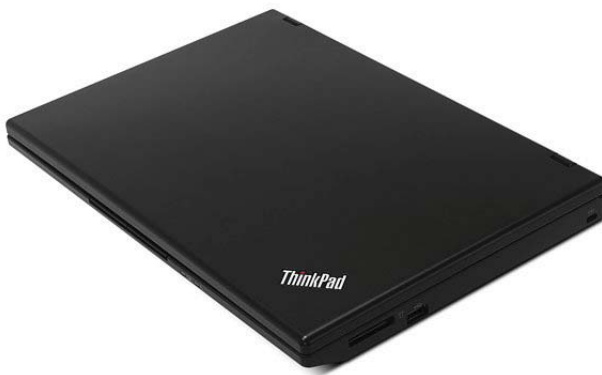
Lenovo ThinkPad X100e