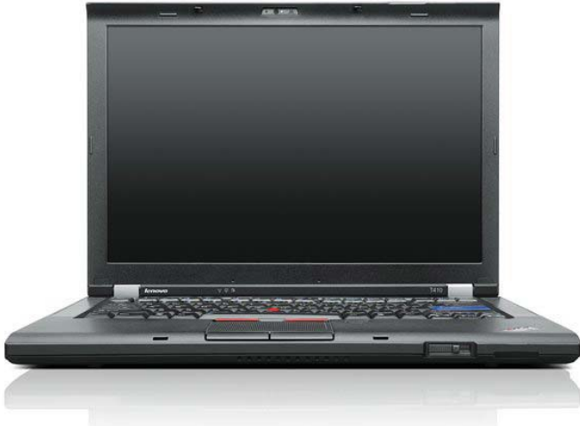
Lenovo® ThinkPad T410