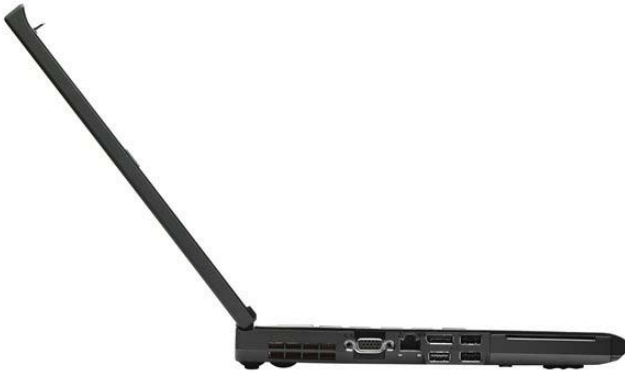
Lenovo ThinkPad T410