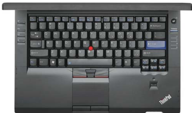
Lenovo ThinkPad L412