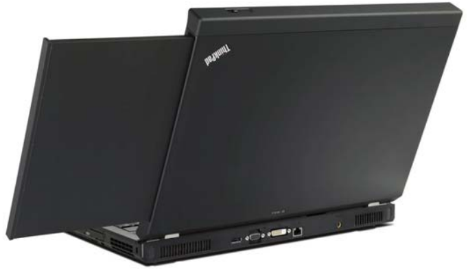
Lenovo ThinkPad W701ds