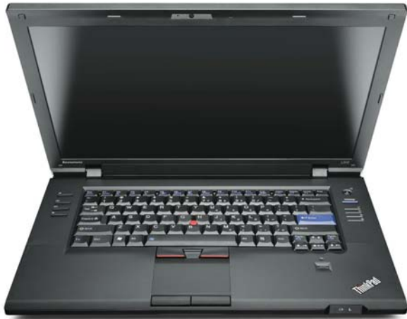
Lenovo® ThinkPad L512