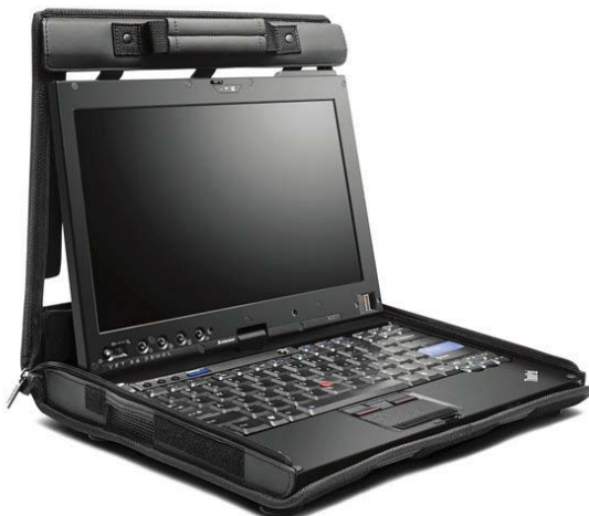
Lenovo ThinkPad X201 Tablet with ThinkPad X200 Tablet Sleeve 43R9115