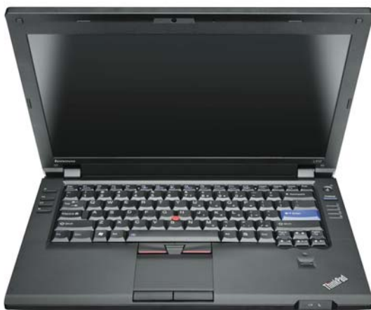
Lenovo ThinkPad L412