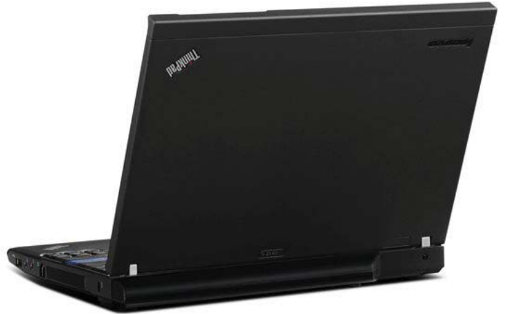
Lenovo ThinkPad X201 with ThinkPad Battery 47++ (9-cell) 43R9255