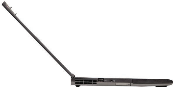
Lenovo ThinkPad T410s