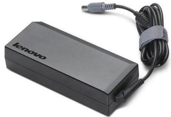
ThinkPad 135W AC Adapter 55Y9317