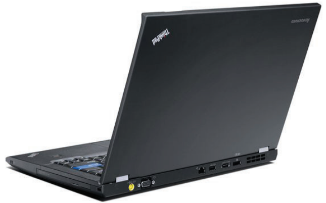
Lenovo ThinkPad T410s