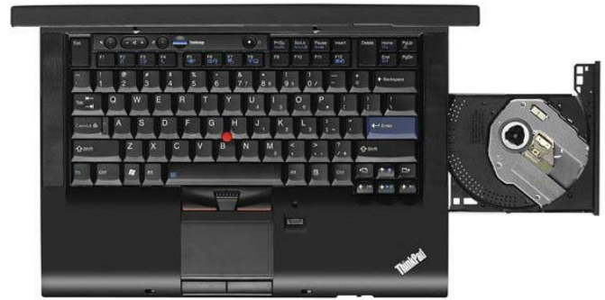
Lenovo ThinkPad T410