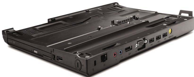
ThinkPad X200 UltraBase 43R8781