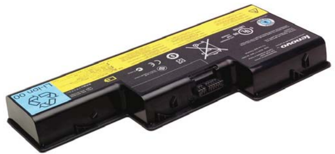
ThinkPad Battery 37++ (9-cell) 45J7914