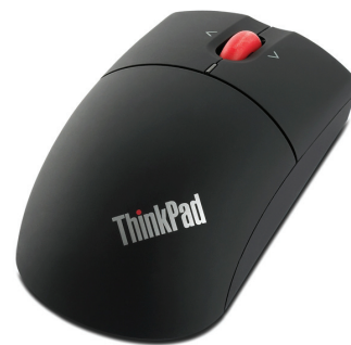
ThinkPad Bluetooth Laser Mouse 41U5008