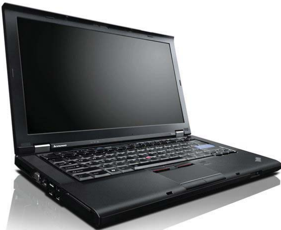
Lenovo ThinkPad T410