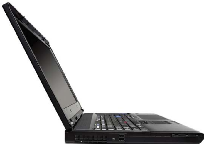
Lenovo ThinkPad W701