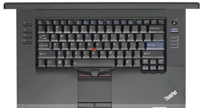
Lenovo ThinkPad L512