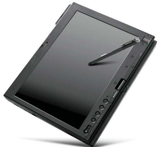
Lenovo ThinkPad X201 Tablet