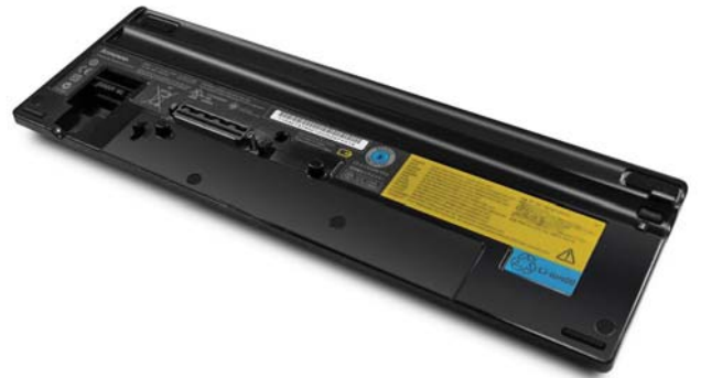
ThinkPad Battery 27++ (9-cell, slice) 57Y4545