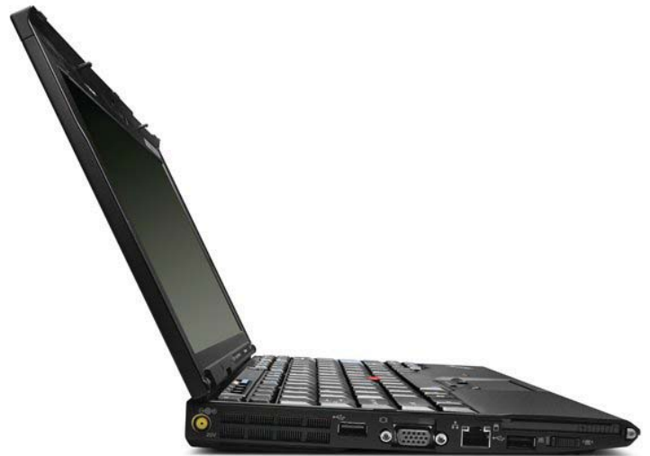
Lenovo ThinkPad X201 (UltraNav model)