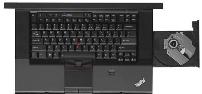
Lenovo ThinkPad T510