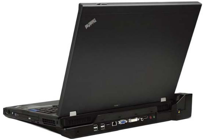
Lenovo ThinkPad W701 with ThinkPad W700 Mini Dock 2.0 57Y4345