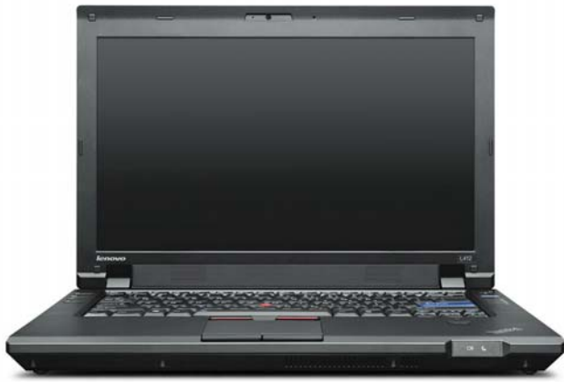
Lenovo® ThinkPad L412