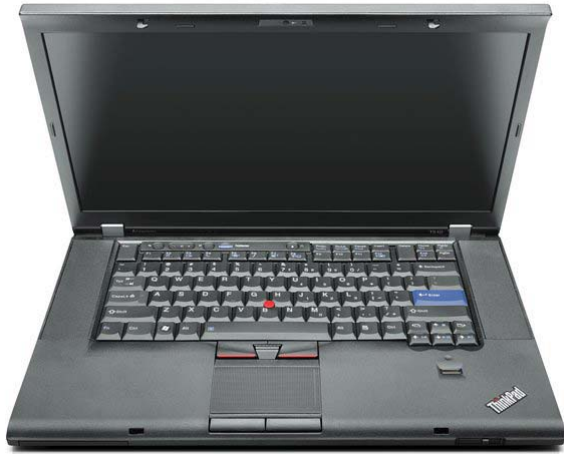
Lenovo® ThinkPad T510