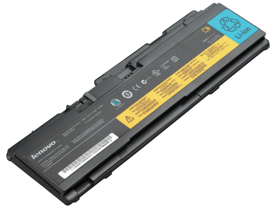
ThinkPad Battery 59+ (6-cell) 51J0497