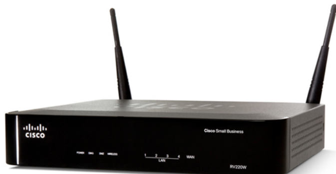
Figure 1. Cisco RV220W Network Security Firewall

To help further safeguard your network and data, the Cisco RV220W includes business-class security features and optional cloud-based Web filtering. Setup is simple, using a browser-based configuration utility and wizards.