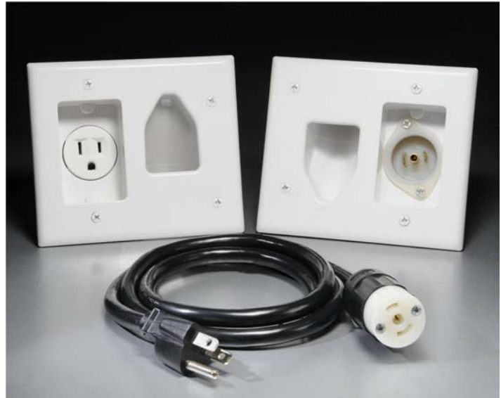
45-0021-WH Plate, 45-0022-WH Plate & 6 Ft. Locking Extension Cord

Using the local electrical code approved installation, pull an approved 14/2 with ground or 12/2 with ground building wire cable from the installed Recessed Low Voltage Cable Plate with Power to the selected site in the equipment room. Install a new or old workbox before installing the Recessed Pro-Power Cable Plate with Locking Inlet. This is a non-energized connection. To energize this connection, simply plug the supplied 6 ft. locking extension cord into the recessed locking inlet and plug the straight blade end of the extension cord into your rack mounted surge protector.