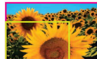
WXGA 1,280 x 800 PIXELS

With WXGA (1280 × 800) and WUXGA (1920 × 1200) native resolutions, the IN5500 series offers substantially wider space to display high resolution images for the next generation of operating systems and full high definition 1080p video.