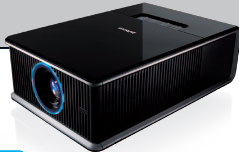
Optional Skin: Gloss Black

The IN5500 series delivers a stunning combination of HD resolution and vivid detail in true-to-life colors with a 6-segment color wheel, the latest DLP® DarkChip™ technology and the InFocus BrilliantColor implementation.