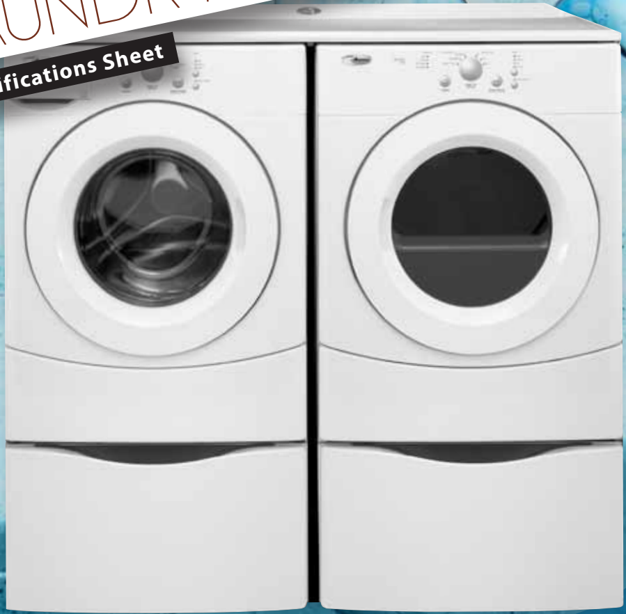
NFW7300WW Shown with optional 15.5" pedestals XHP1550VV and worksurface MW29000TW