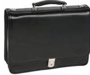
RIVER NORTH | 4355