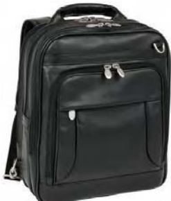
LINCOLN PARK | 4165