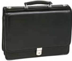
BUCKTOWN | 4354