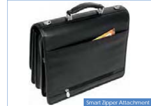
Smart Zipper Attachment