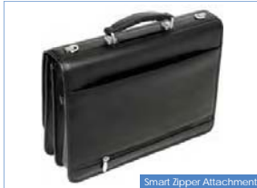
Smart Zipper Attachment