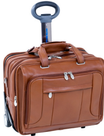
WEST TOWN | I5704