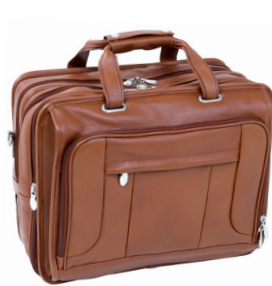
RIVER WEST | I5714