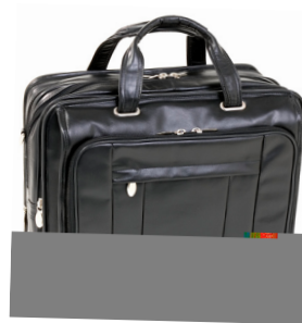
RIVER WEST | I5715