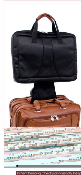
Patent Pending Checkpoint-Friendly Design