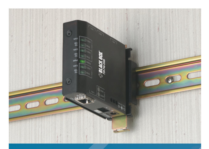
The DIN Rail Mounting Bracket (DIN-RAIL MC2) features a spring latch that enables you to quickly add or remove a module without using a screwdriver . Like the Media Converter Switches, the bracket is all metal, tough, and durable.