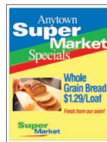
8.5" x 11" Transparency Film