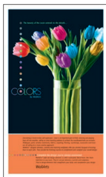
8.5" x 14" Legal

For high-quality, flexible performance that will increase your productivity and improve your image, C6050 Series color printers from OKI Printing Solutions are the way to go.