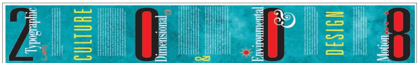
8.5" x 48" Banner