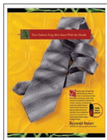
8.5" x 11" Letter