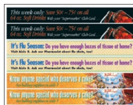
8.5" x 11" Card Stock