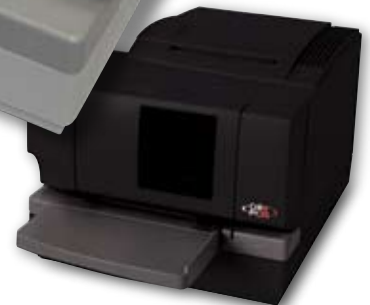
Check Flip Option Available